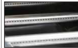
Our CROSS FLOW IGNITION system allows you to ignite once, and then each burner fires in sequence.