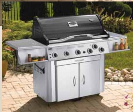
Signature Series Grills | VCS5016 Grill

A serious grill for the serious griller. And a great platform for Vermont Castings Signature Flavor Process. 600 square inches of cooking area and 230 square inches of secondary cooking space. 5 Stainless Steel Tube Burners, our special Infra-Red Rotisserie Cooking System, NeverFail Electronic Ignition system, and much more. And all with our distinctive black enamel lid with Signature Cast Iron Hood End Caps.