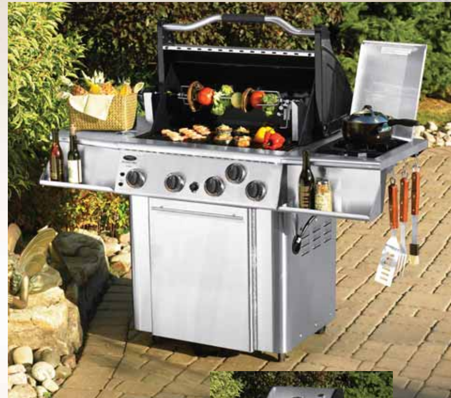
4 Burner 50,000 BTU Stainless Steel Grills

Cast Iron and Stainless Steel, this 4 burner grill is a monument to modern grilling. The perfect size for many different outdoor applications, this grill has 450 square inches of primary cooking area and 170 square inches of secondary cooking space. Comes with a 15,000 BTU side burner to keep sauces hot or to cook side dishes. A 15,000 BTU Infra-Red Rotisserie Cooking System, smoker box compatibility, and our super-thick cast iron cook grids with rear lip make this the grill to envy.