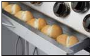
Convenient WARMING DRAWER keeps breads and buns warm and toasty!