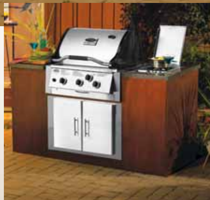
3 Burner 37,500 BTU Stainless Steel Grill