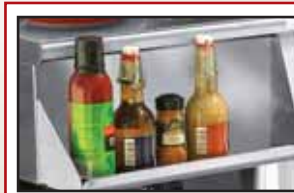
The convenient CONDIMENT TRAYS on many of our grills put ingredients right within your reach for easy use.

Ribs, chicken, roasts, lobsters, all in large portions will find a delicious home on the Porcelain-Coated Cast Iron cooking surface. And with our extra large side burner, condiment tray, built in tool holder and tank pull out tray, it's as convenient as it is beautiful.