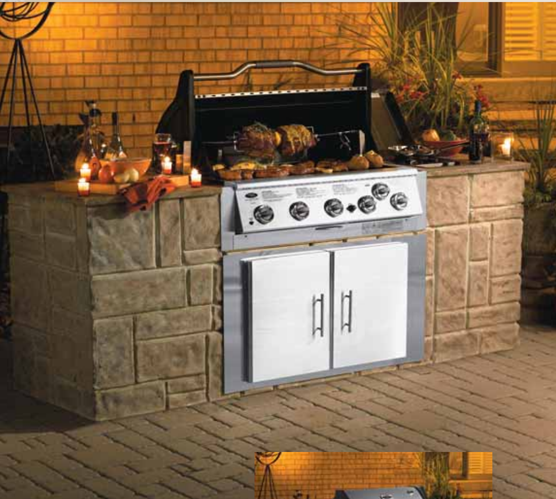
5 Burner 62,500 BTU Stainless Steel Grill