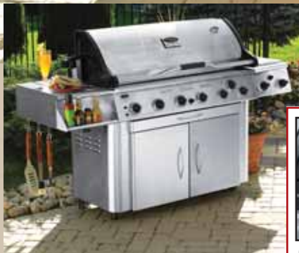
6 Burner 75,000 BTU Stainless Steel Grill