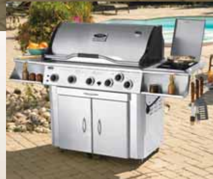
5 Burner 62,500 BTU Stainless Steel Grill