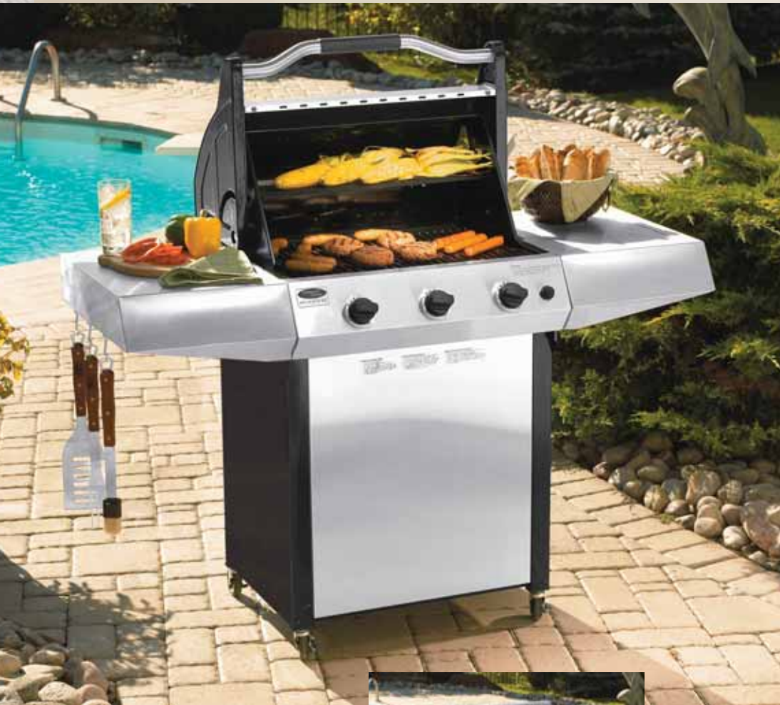
3 Burner 37,500 BTU Stainless Steel Grill