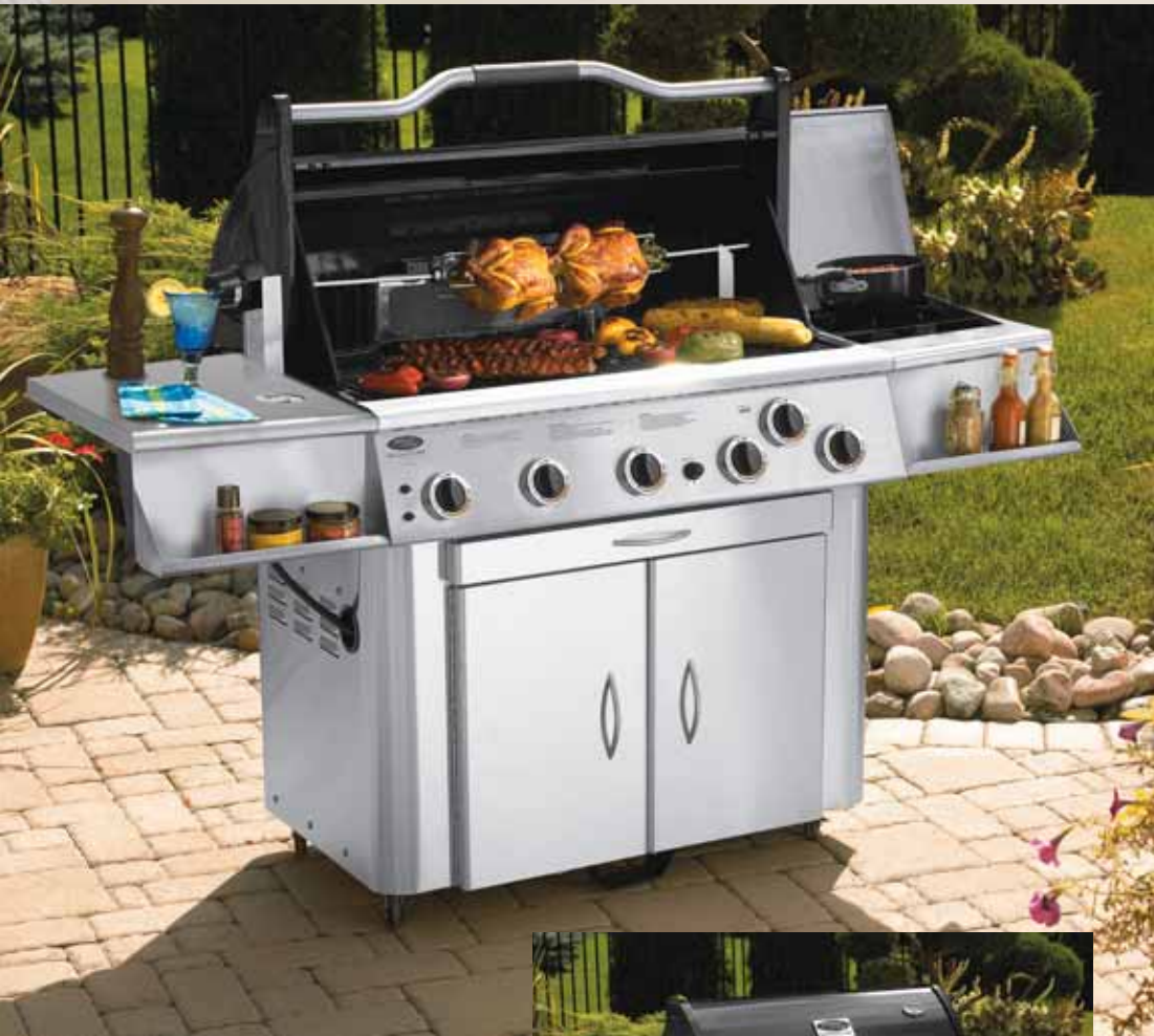
5 Burner 62,500 BTU Stainless Steel Grill