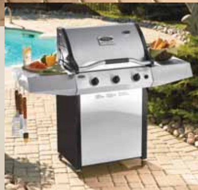
Signature Series Grills | VCS3506 Grill

When you fit the amazing Signature Flavor Process Cooking System into a 3-burner grill, you know you have the best value in grilling around. 400 square inch primary cooking area and 150 square inches of secondary cooking space, NeverFail Electronic Ignition, Porcelain-Coated Cast Iron cooking surface and stylish stainless steel lid with Signature Cast Iron Hood End Caps, means you get quality, dependability, and outstanding grilling results in a grill that fits modest areas.