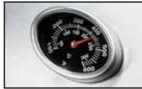
THERMOMETER on the outside hood lets you know the exact temperature on the inside, and helps you cook more efficiently.