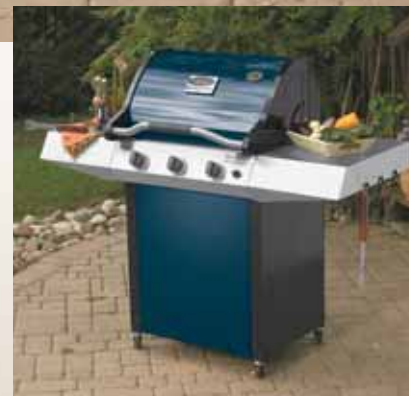
3 Burner 37,500 BTU Grill