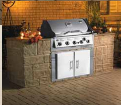
Signature Series Grills | VCS5006 Built-In Grill

The perfect way to complement your outdoor living, Vermont Castings Built-in gas grills are every inch a Vermont Castings Signature Series masterpiece. Each can be installed into a complete outdoor cooking center, with options that include built-in side burner and front door assembly.