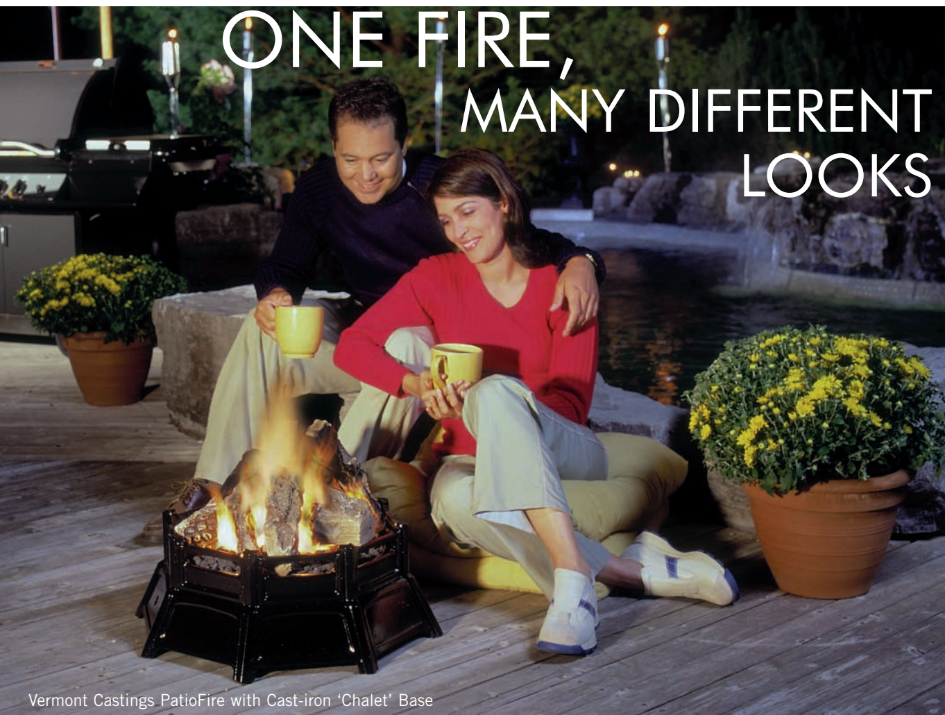
Vermont Castings PatioFire with Cast-iron 'Chalet' Base