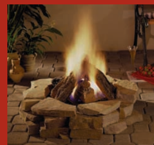
Vermont Castings PatioFire includes burner and logs. You build the surround (shown here with ledge stone)