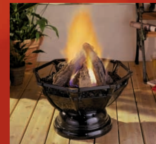
Vermont Castings PatioFire with Cast-iron 'Villa' Base