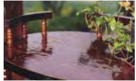
A Carrier humidifier helps protect your furnishings for years by preventing damage due to dryness, cracking and separating.

As warm, dry air passes through the humidifier pad, moisture is absorbed into the air and distributed throughout your home for a more comfortable indoor environment.