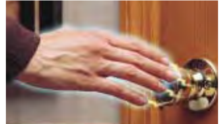
You can avoid those annoying shocks of static electricity this winter by adding a Carrier humidifier to your comfort system.

These features, along with our hard-earned reputation for delivering top-quality products make choosing a Carrier humidifier an easy choice. Once you choose Carrier, your local Comfort Control Specialist will analyze your system and help select the perfect humidifier model for controlling your indoor comfort.