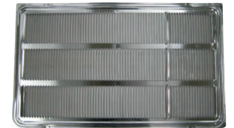
Stamped Aluminum Grille AXRGALA01