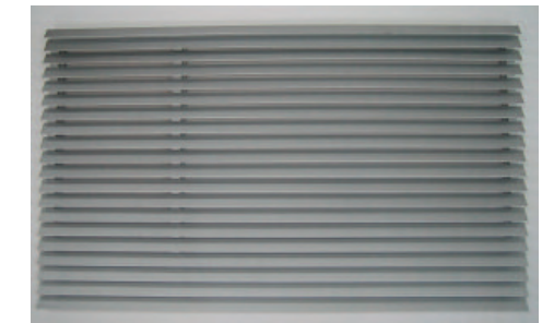
Architectural Grille AXAGALA01A Available in aluminum, dark bronze and soft dove