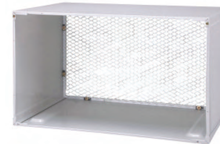
Wall Sleeve AXSVA1A-1