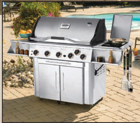
Signature Series | 5-Burner Grills

A beautiful, polished stainless steel lid 5 burner grill as one of the most distinguish Delivering superior flavor, outstanding heat and remarkable efficiency, no other grill our cooking system. 600 square inches cooking area and 230 square inches of cooking space can accommodate a full th meal and more. Double condiment trays, BTU Infra-Red Rotisserie Cooking System, "S back-lit dials and more, it's all here and rea Add our heavy duty Signature Series Grill "Sizzling Barbeque" Cook Book, and you'll the best in any meal.