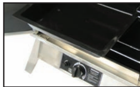
CAST IRON wood chip box has a convenient sliding shelf for easy chip removal.