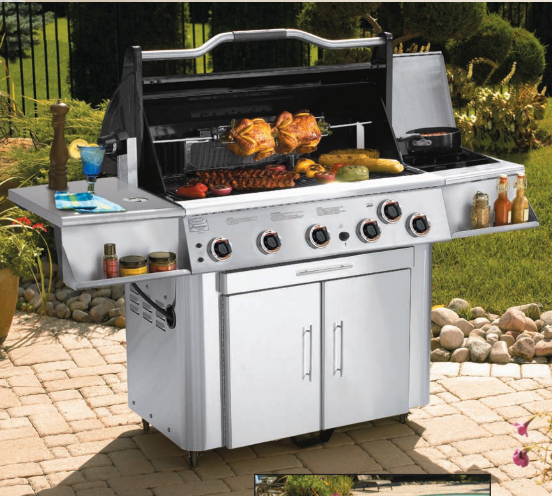
Model: VCS5007 5-Burner 62,500 BTU Stainless Steel Grill