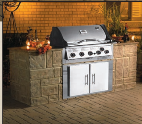
Model: VCS5007BI 5-Burner 62,500 BTU Stainless Steel Grill (island not included)

600 square inches of primary cooking area and 230 square inches of secondary cooking space on this 5 burner model. It also includes a 20,000 BTU Infra-Red Rotisserie Cooking System, optional NeverFail Electronic Ignition, Porcelain-Coated Cast Iron cooking surface and stainless steel lid with Signature Cast Iron Hood End Caps.