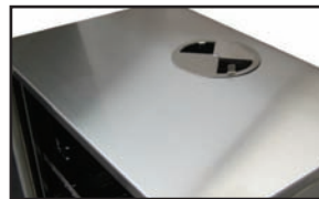
FULLY-ADJUSTABLE DAMPERS allow for precise smoking.