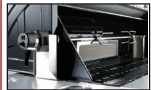
Our ROTISSERIE KIT AND BURNER allows for slow and even cooking for roasts and whole chickens, every time.

Available with a Stainless Steel Lid, or Limited Porcelain Enameled lids in: Mica Black, Mica Deep Bronze.