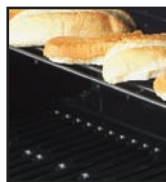
TOP WARMING RACK helps keep food warm and ready to serve.