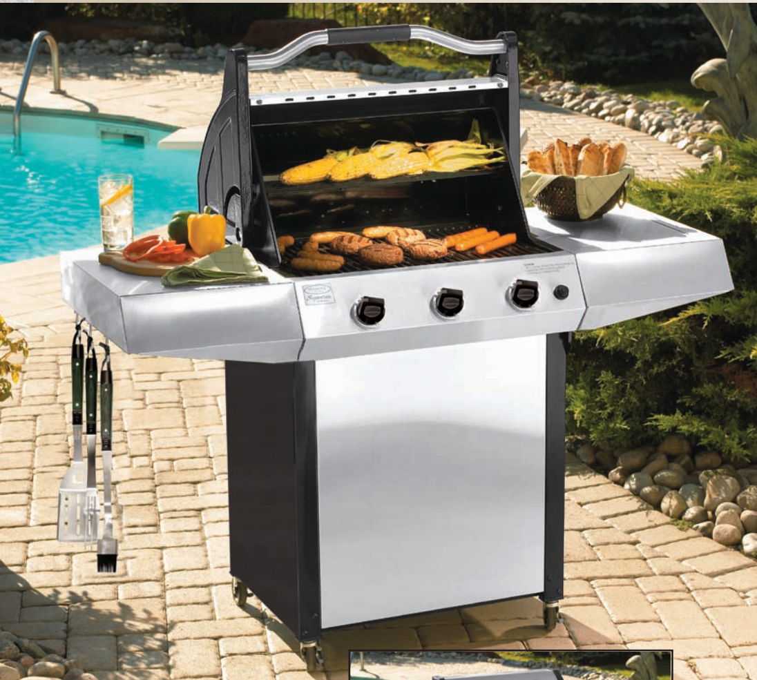
Model: VCS3507 3-Burner 37,500 BTU Stainless Steel Grill