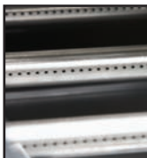
Our CROSS FLOW burner system allows you to control the heat of each burner fire.