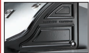
Our double-walled lid panels and CAST IRON HOOD END CAPS help retain the heat for more efficient cooking and superior flavor retention.

Comes with flush mounted side shelves, an optional side burner, a 15,000 BTU side burner, enclosed Stainless Steel side burner, Signature Design, commercial grade castors and much more. Available with a Stainless Steel lid, or with a Limited Lifetime Porcelain Enamelled Mica Black lid.