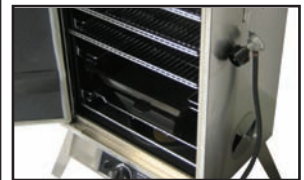
ELECTRONIC IGNITION starts quickly every time, whenever you're ready.