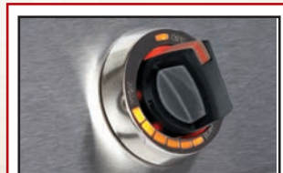
"SOFTTOUCH" BACK-LIT DIALS make cooking at night easier than ever with a bright orange glow to tell you what temperature has been set.