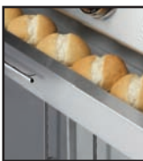
Convenient WARMING RACK keeps breads and buns warm and toasty!