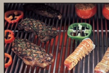
Infrared Plus...Stainless Steel Traditional Burners