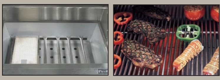
Infrared Plus...Stainless Steel Traditional Burners