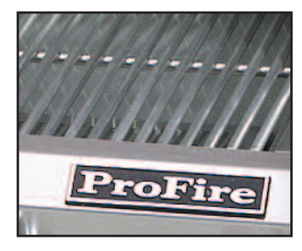
Stainless Steel Cooking Grids 5/16" thick rods with spacing to accommodate small items. Lifetime Warranty.

ProFire Grill Lids All ProFire grill lids have 2 layers of heavy-duty stainless steel that prevent heat loss and keep the outer lid cooler. The PF Series sports a seamless lid that is accented with a polished mirror finish. Lifetime Warranty.