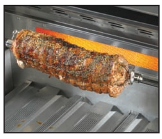
Infra-Roast® Rotisserie Burner Infrared rear burner heats up fast to quickly put a seal around meats for juicier and more moist results.

Standard on all "R" model number grills.