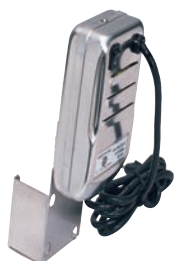
PFR80-97 (Motor Bracket Included)