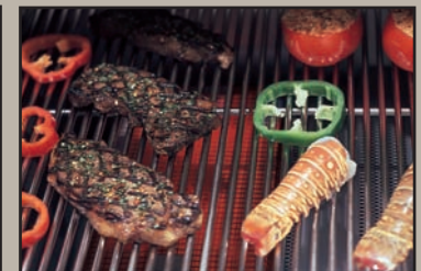
Infrared Plus...Stainless Steel Traditional Burners