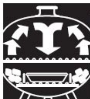
Charcoal Briquet Guide for the Indirect Method of Cooking