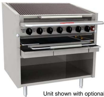
Unit shown with optional lower rack