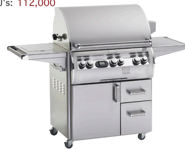
SHOWN WITH SINGLE SIDE BURNER