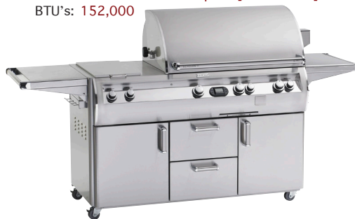
SHOWN WITH DOUBLE SIDE BURNER