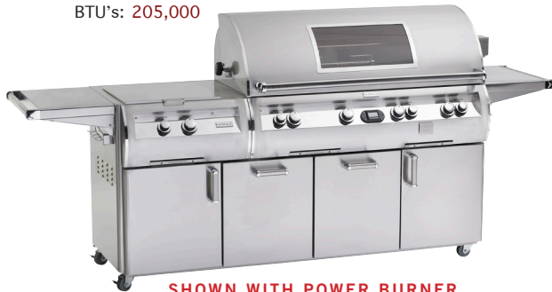
SHOWN WITH POWER BURNER

COOKING SURFACE: 660 sq. in. [30" X 22"] BTU's: 112,000