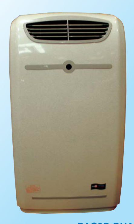
PAC9D DUAL PIPE