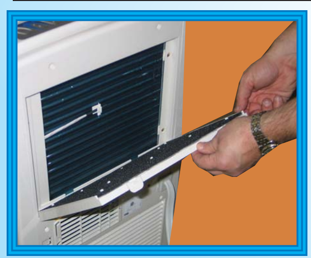
Easy To Remove Washable Filter