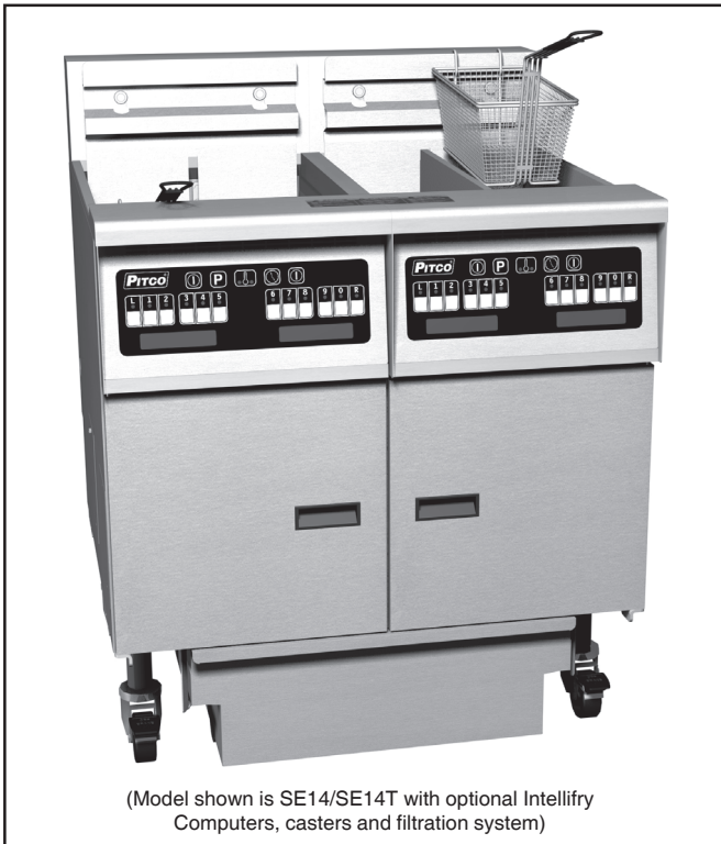
(Model shown is SE14/SE14T with optional Intellifry Computers, casters and filtration system)