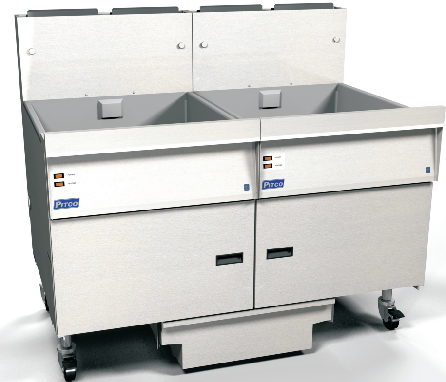
Two FBG24x24 fryers with self contained oil filtration system.