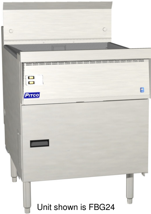
Unit shown is FBG24

Model FBG18 and FBG24 Flat Bottom Gas Fryers