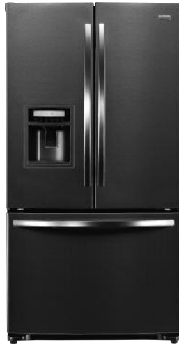
Kenmore Elite 25 cu. ft. Bottom Freezer Refrigerator