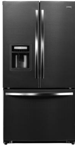
Kenmore Elite 25 cu. ft. Bottom Freezer Refrigerator