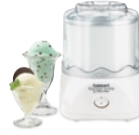
Ice Cream Makers

Discover the complete line of Cuisinart® brand premier kitchen appliances including food processors, mini food processors, hand mixers, blenders, toasters, coffeemakers, cookware, ice cream makers and toaster ovens at