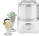
Ice Cream Makers

Cuisinart offers an extensive assortment of top quality products to make life in the kitchen easier than ever. Try some of our other countertop appliances and cookware, and Savor the Good Life™.