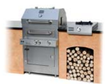
Kalamazoo 450HB HYBRID