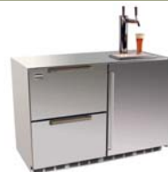
Keg Tappers & Keg Tappers with Refrigerators