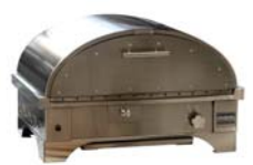
Outdoor Artisan Pizza Oven for convenient countertop use