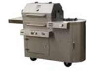
Kalamazoo 450HS HYBRID