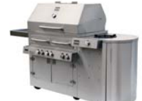
Kalamazoo 900HS HYBRID