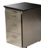
Drawers, cabinets, sink bases and recycling

Visit our website for a complete system catalog.