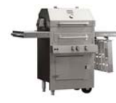
Kalamazoo 450HT HYBRID