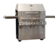
Kalamazoo 900HT HYBRID