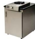
Wok-ready cooktops, lobster boil pits and more