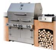
Kalamazoo 900HB HYBRID