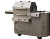
Kalamazoo 450HS HYBRID