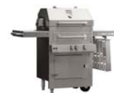
Kalamazoo 450HT HYBRID