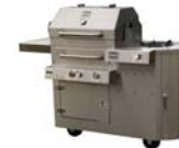
Kalamazoo 450HS HYBRID