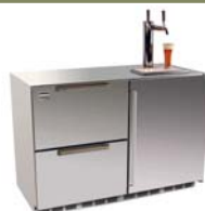
Keg Tappers & Keg Tappers with Refrigerators