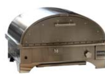
Outdoor Artisan Pizza Oven for convenient countertop use