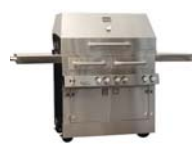
Kalamazoo 900HT HYBRID