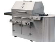
Kalamazoo 900HS HYBRID