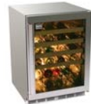
Wine Chillers & Beverage Centers

Visit our website to see the full range.