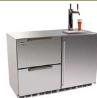
Keg Tappers & Keg Tappers with Refrigerators