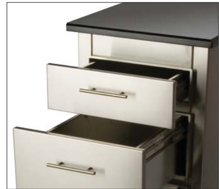
Our weather-tight design features seamless rain gutters around every door and drawer opening. Kalamazoo Outdoor Gourmet cabinets are the only ones to feature all stainless steel hardware, including the slides and hinges.

Helpful Extras Our line is truly optimized to serve every need of the outdoor cook. Glide-out cabinet bottoms provide easy access to heavy items like charcoal and wood. Under-counter trays keep cutting boards at the ready. Slot systems inside the doors accommodate utensil hooks, waste bins and sauce racks. Pull-out spice racks keep things accessible. These details and many more help a Kalamazoo kitchen deliver the best outdoor cooking experience.