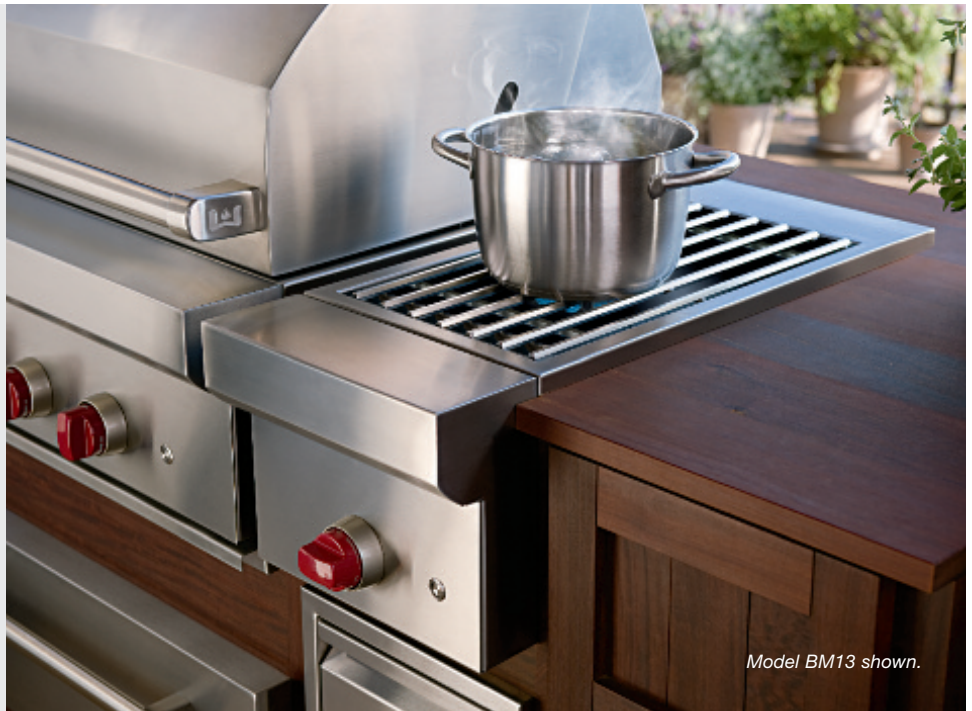
Model BM13 shown.

The burner module lets you prepare side dishes or warm barbecue sauce without having to run inside. Constructed of heavy-duty stainless steel, the 25,000 Btu burner module model BM13 can be built into an outdoor kitchen, and the side burner model SB13 can be attached to a cart. Available in natural or LP gas.