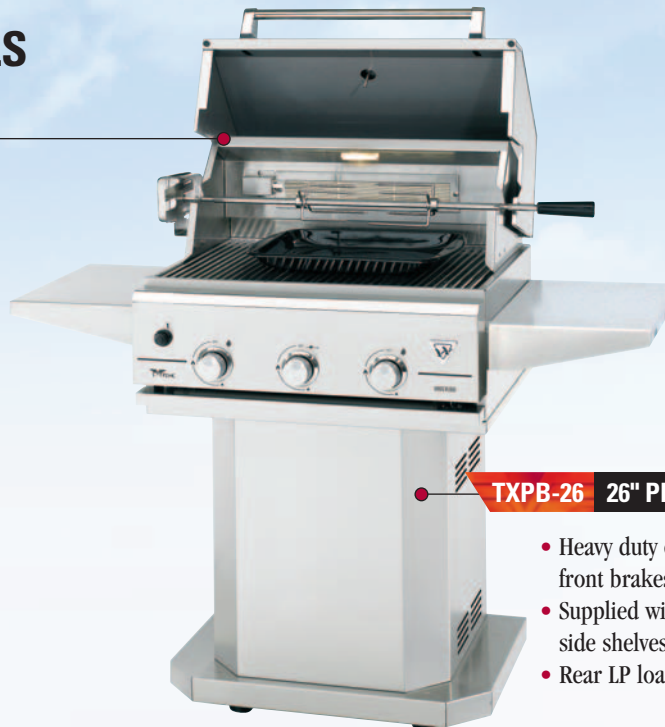
TXPB-26 26" PEDESTAL BASE