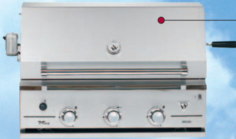
TXBQ-32-T 32" OUTDOOR GAS GRILL

Available with or without INFRARED ROTISSERIE