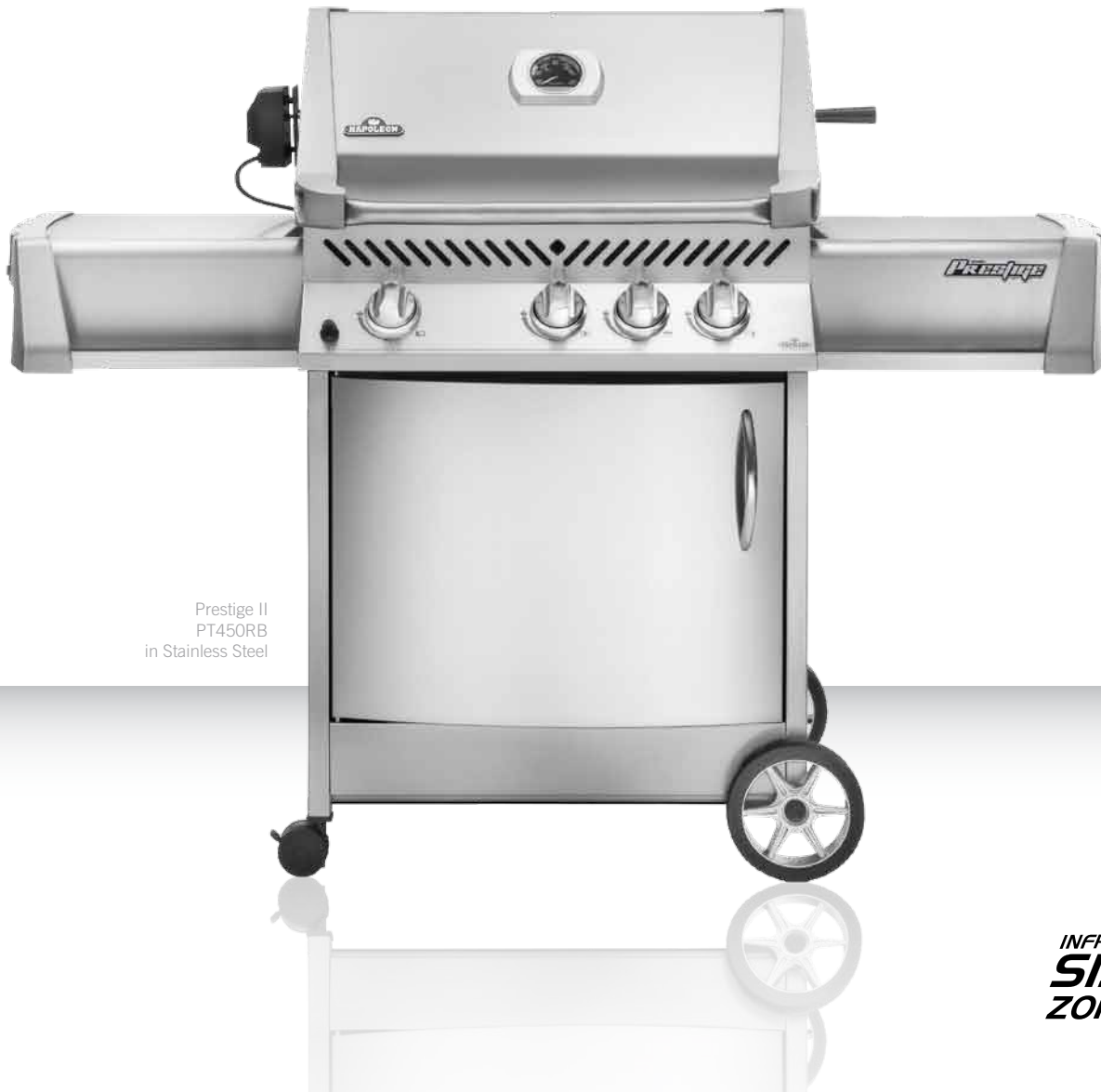
Prestige II PT450RB in Stainless Steel