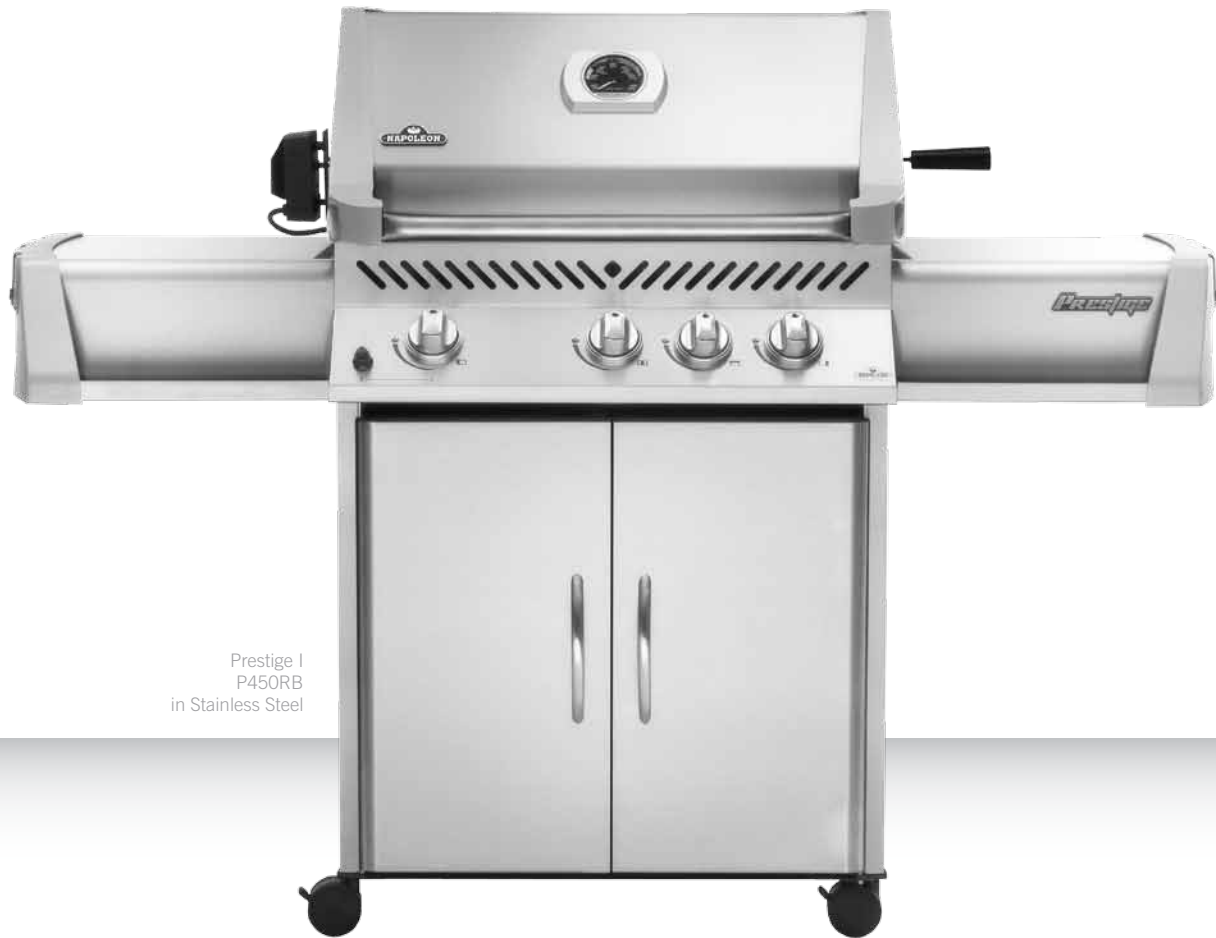
Prestige I P450RB in Stainless Steel