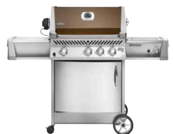
PT450RBI in Bronze Mist Enamel with optional side burner