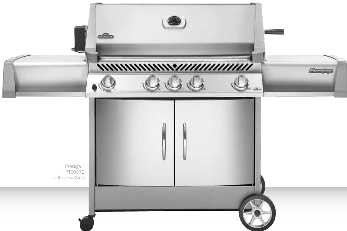
Prestige II PT600RB in Stainless Steel