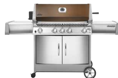
PT600RBI in Bronze Mist