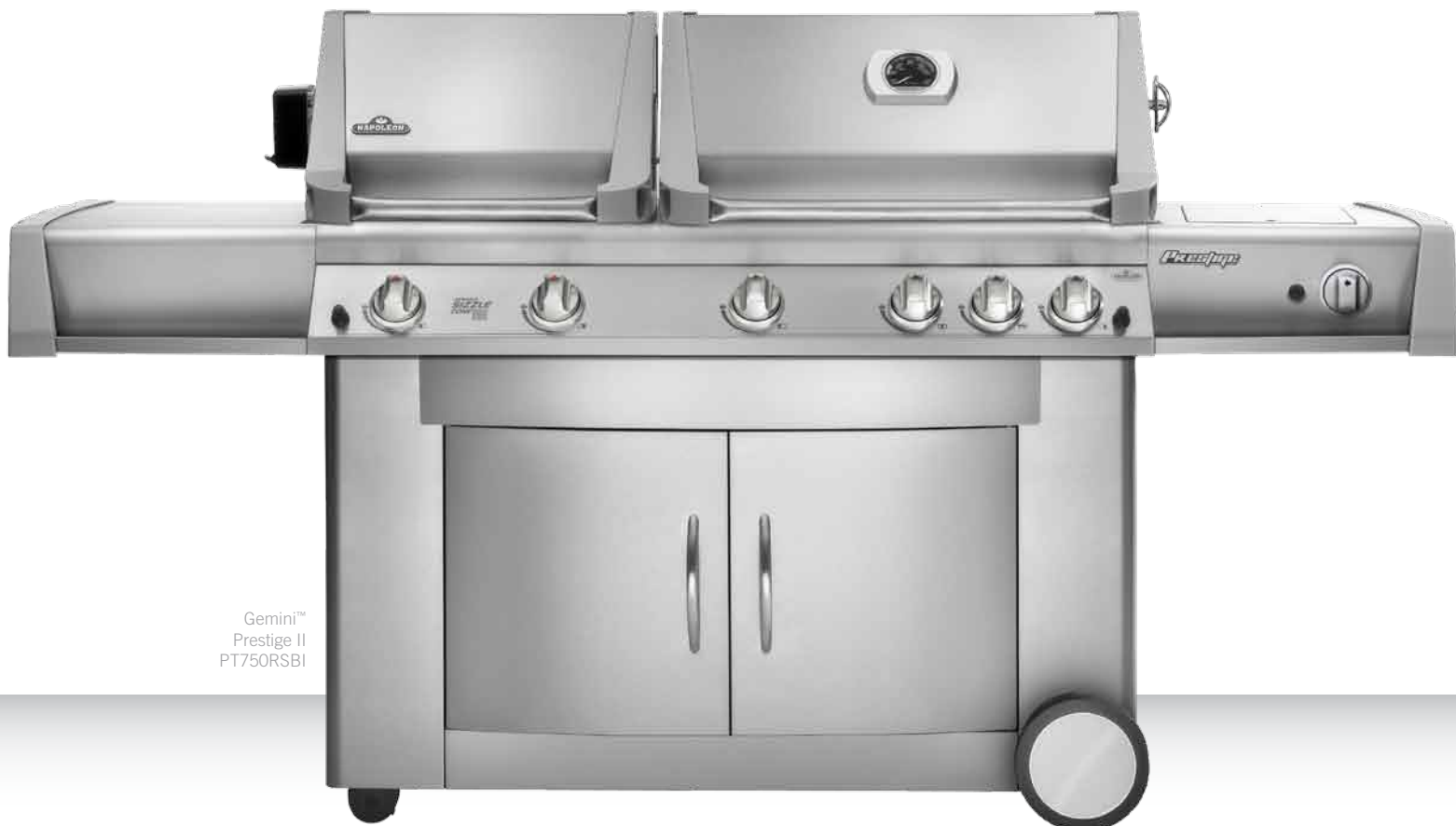
Gemini™ Prestige II PT750RSBI