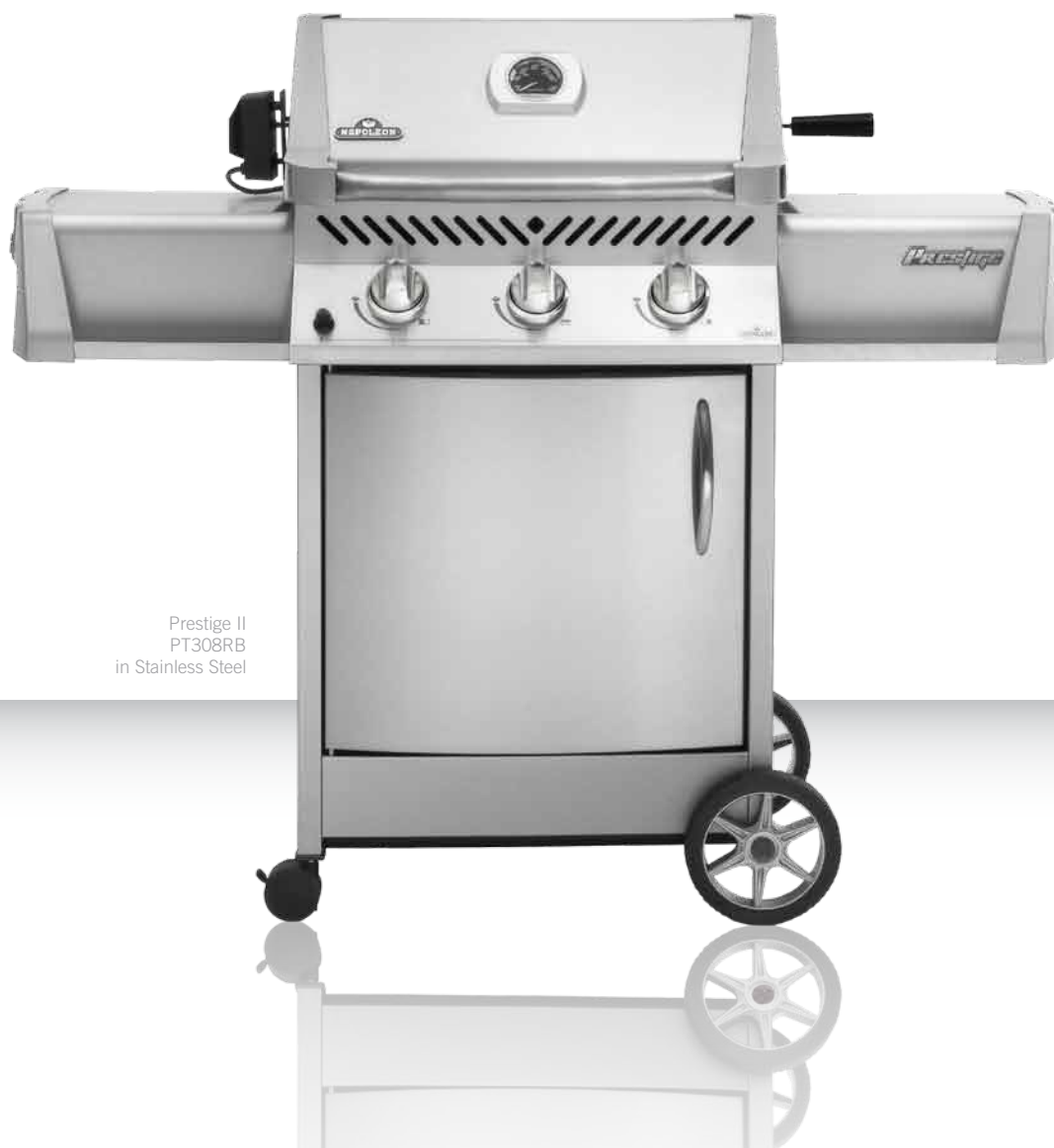
Prestige II PT308RB in Stainless Steel