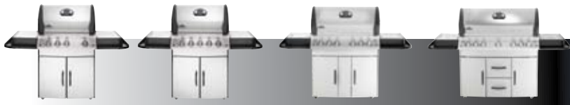
M485RB M485RSIB M605RSBI M730RSBI