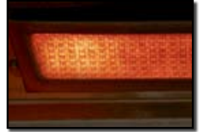
Rear ceramic infrared rotisserie burner for restaurant style results and perfect self-basting roasts.