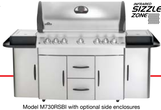
Model M730RSBI with optional side enclosures