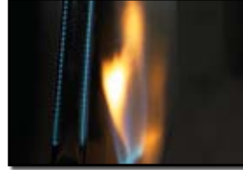
Reliable JETFIRE™ ignition system and stainless steel tubular burners.