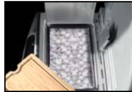
Integrated ice bucket and cutting board in stainless steel side shelf (excluding M485RB).