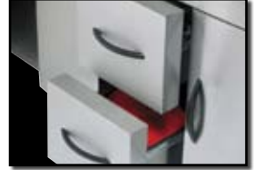
EASY SLIDE™ centre drawers for additional space. Standard on model M730.