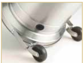
Easy roll wheels on LP model for location flexibility

A 25' diameter of radiant heat casts a warm glow keeping you warm and extending your outdoor enjoyment