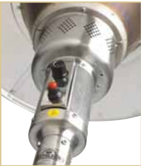
Easy to use controls

Double Grate Conical Burner provides low energy consumption with high heat output