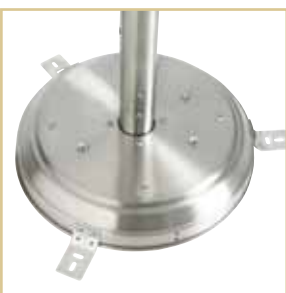
Hold down clamps for extra stability on natural gas models

A 25' diameter of radiant heat casts a warm glow keeping you warm and extending your outdoor enjoyment