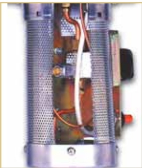
Durable, long lasting cast aluminum valve