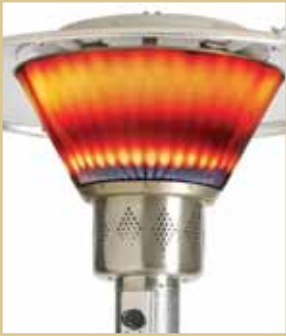
High output, fuel efficient burner

Double Grate Conical Burner provides low energy consumption with high heat output