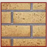
Decorative Sandstone brick panels