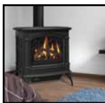
Cast Iron Gas Stoves