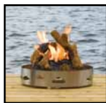
Outdoor Living Products