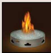
CRYSTALINE™ ember bed