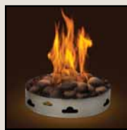
River Rock ember bed