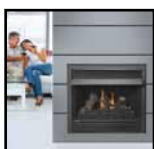
Vent Free Fireplaces