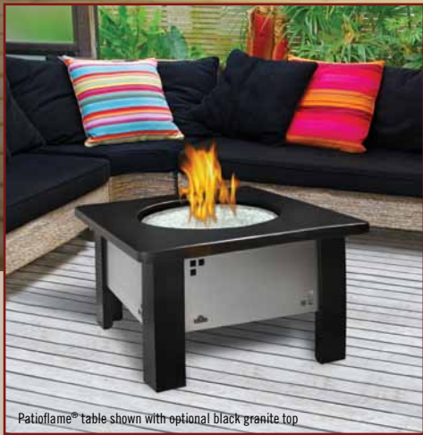
Patioflame® table shown with optional black granite top