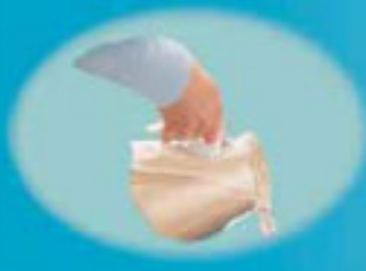
Easy Pour-in Fill