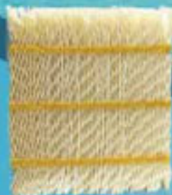
Uses Replaceable 1043 Superwick®