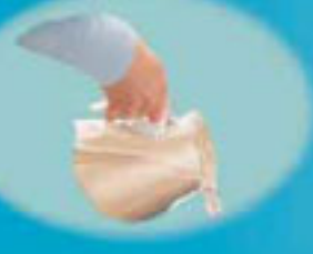
Easy Pour-in Fill