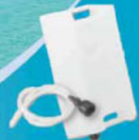
Easy-fill dual water bottles with refill hose