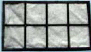
2-Stage AirCare® Filter #1051

Holding over 5 gallons, this handsome unit boasts 12 gallons output per day, effectively humidifying up to 2,500 square feet.