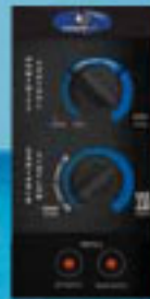
Variable Speed Analog Control

Traps airborne impurities Prolongs life of wick