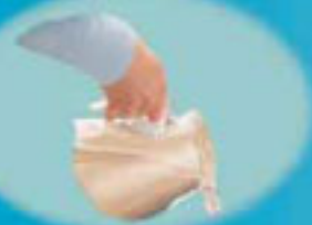
Easy Pour-in Fill