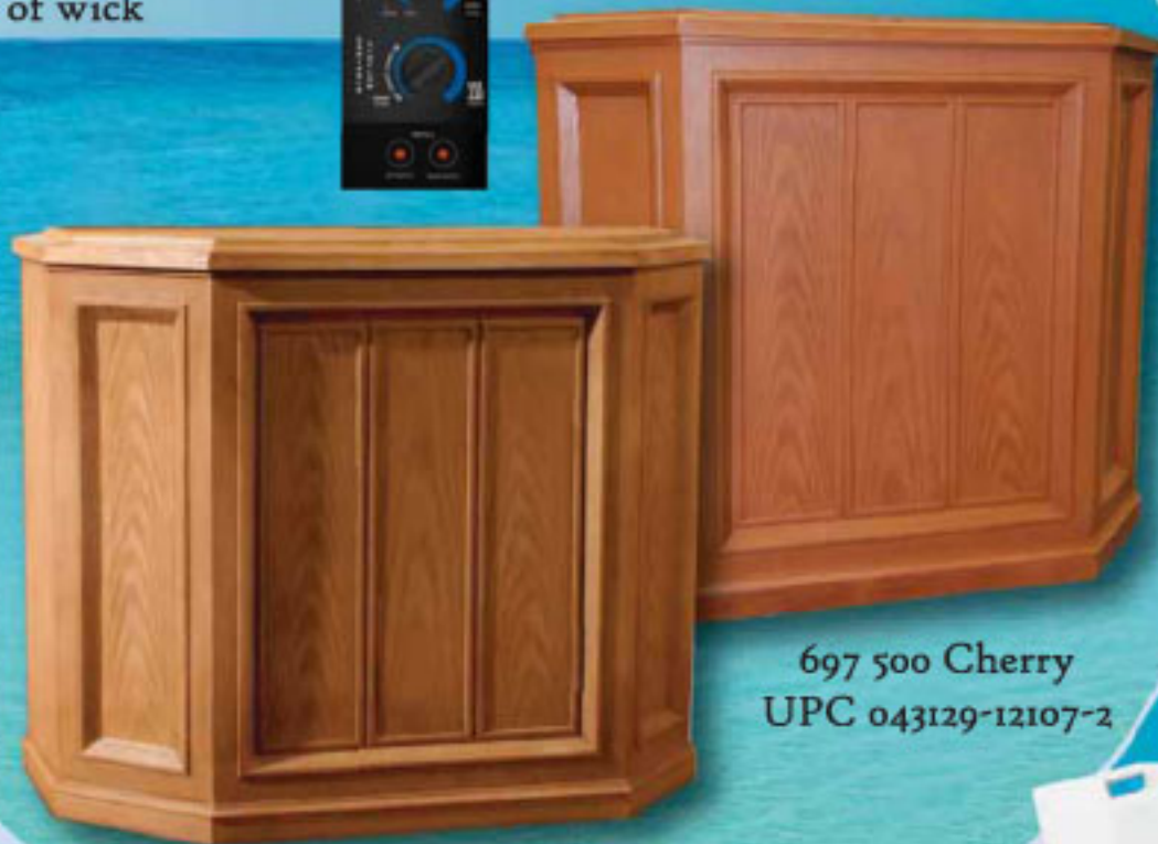
697 500 Cherry UPC 043129-12107-2