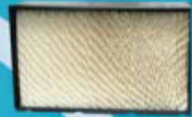
Replaceable SuperWick # 1041 High output, long-lasting