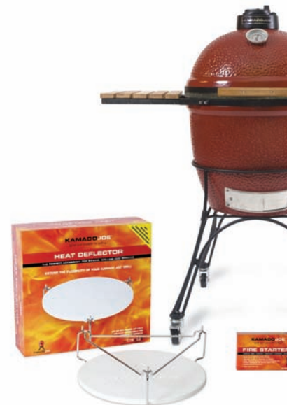
Shown (Left to Right): Heat Deflector, Kamado Joe Pizza Stone, 100% Natural Lump Charcoal

There's nothing better than a grill that requires minimal attention. With us there's no tanks to fill, no gas lines, and no ash to clean up. In fact, our grills are so easy to use and you're ready to go. For more information on Low Maintenance, see the Maintenance section on page 16.