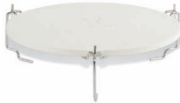
Top position Setting