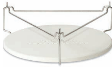
Bottom Position Setting

The metal stand has a two-position setting for the ceramic plate, and it can be used by itself to raise food higher in the grill. Perfect for tender foods like seafood, fish and vegetable. See all the different configurations possible starting on page 12.