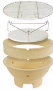
Roasting “Bottom” configuration.