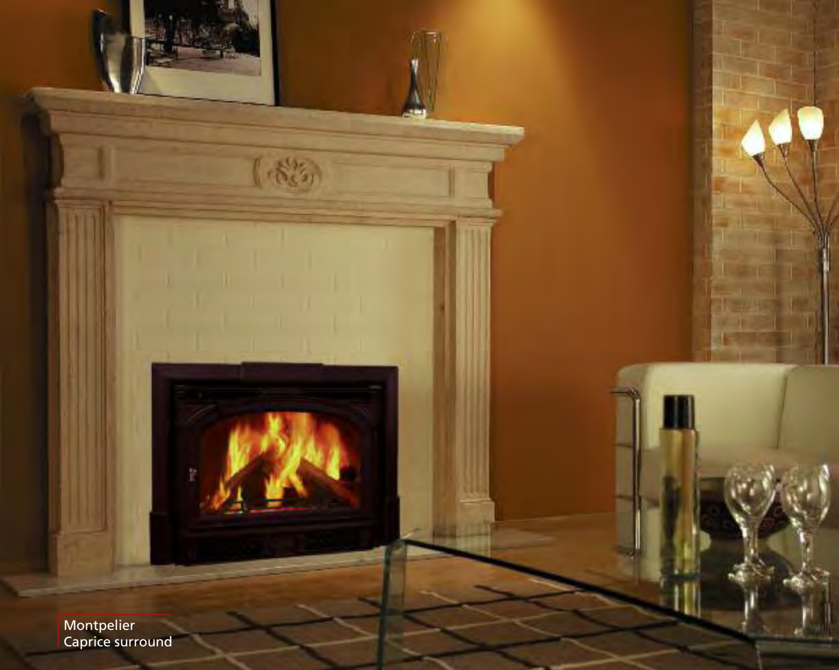
Montpelier Caprice surround