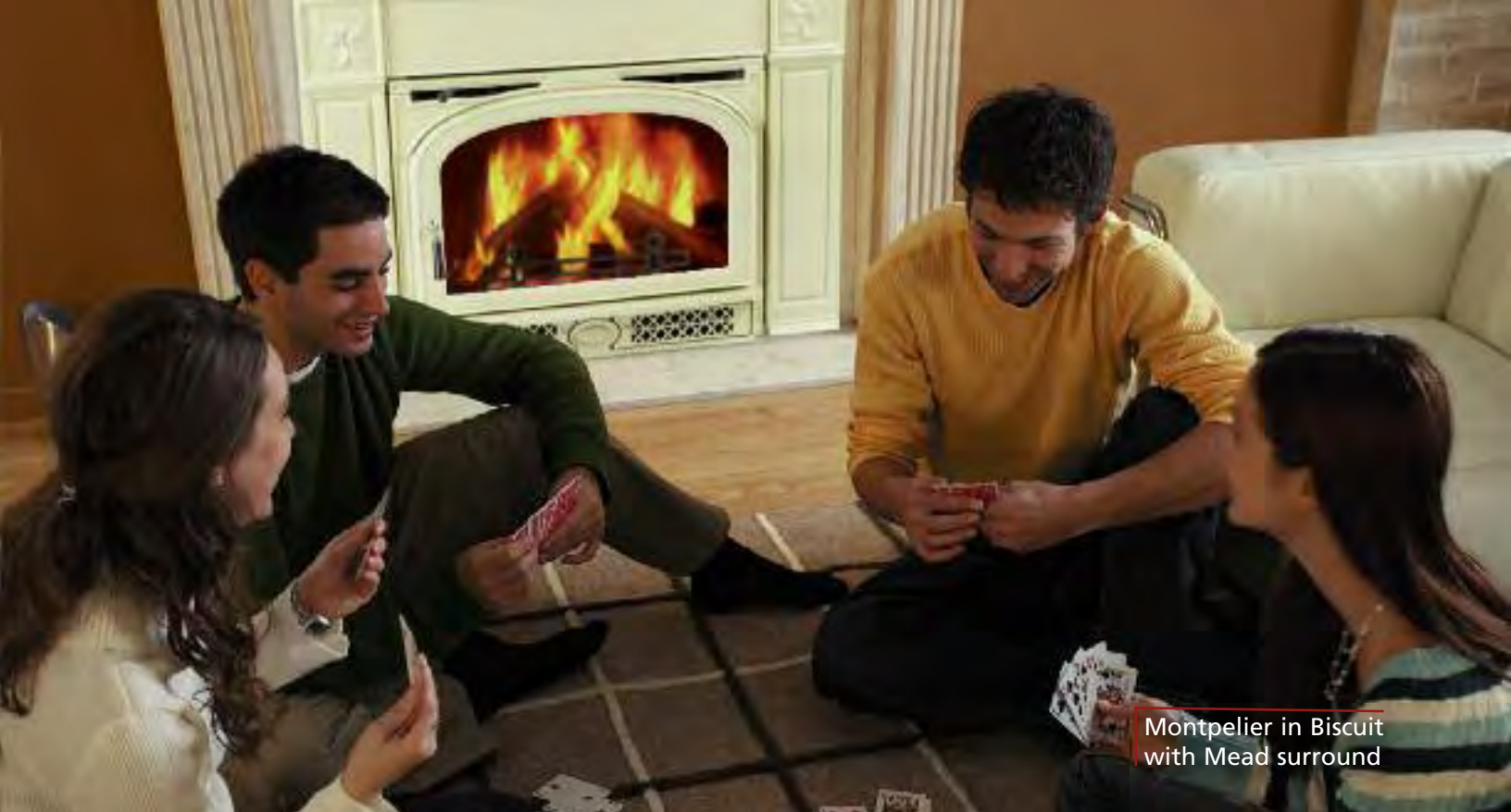
Montpelier in Biscuit with Mead surround