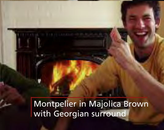
Montpelier in Majolica Brown with Georgian surround