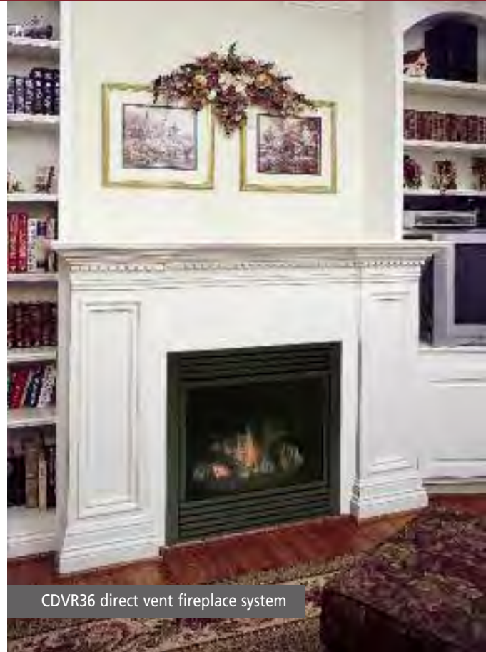
CDVR36 direct vent fireplace system

500DVBL direct vent fireplace system shown on cover