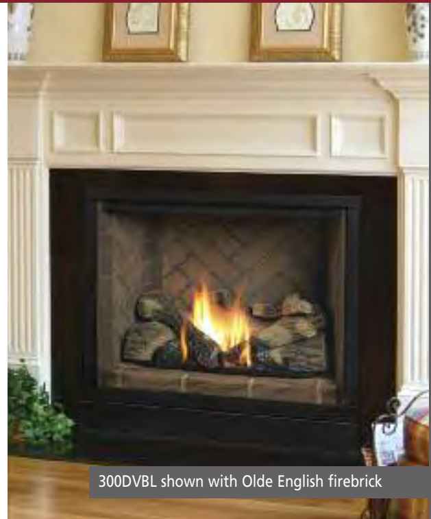
300DVBL shown with Olde English firebrick

As seen on the front cover, the Solitaire DVBL direct vent fireplace system from Majestic offers a contemporary clean-face design with no louvers – providing an expansive viewing area. Available with traditional logs and black porcelain liner, a variety of firebrick options, or with our stone and glass or glass burner, the Solitaire is the perfect addition to any modern room. Standard Signature Command™ System provides one of a kind electronic ignition with battery backup (meaning you can operate your fireplace even in a power outage) and no standing pilot using gas when your fireplace is off. The Solitaire from Majestic is an energy efficient choice as well as a beautiful one.