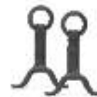
Andirons for DVBL