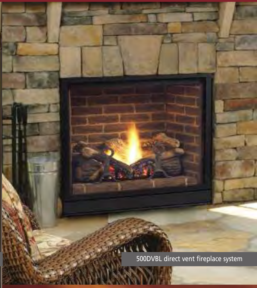
500DVBL direct vent fireplace system