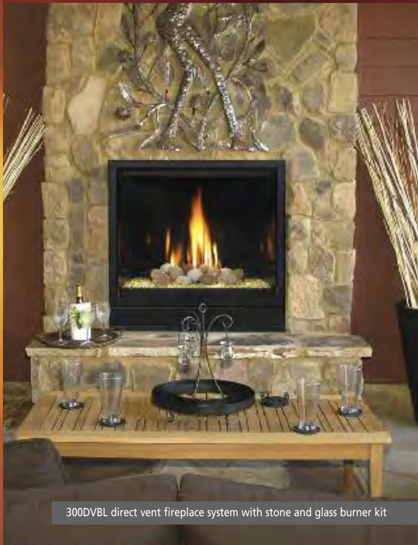
300DVBL direct vent fireplace system with stone and glass burner kit