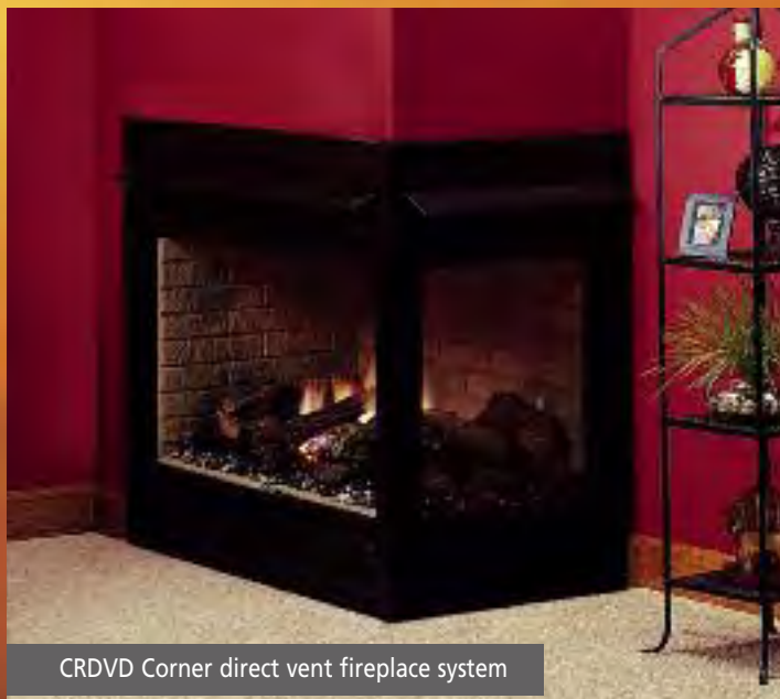
CRDVD Corner direct vent fireplace system

In today's contemporary homes, fireplaces are showing up in all sorts of exciting places such as bathrooms, bedrooms and even as room dividers! Our direct vent Designer Series from Majestic gives you exciting décor options and interesting design applications with Peninsula, See-Thru and Left or Right Corner styles. Plus, with standard Tavern Brown firebrick, louver options and up to 36,000 BTU's, form and function work together to give you an exceptional fireplace performance.