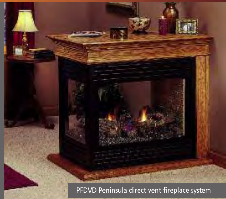
PFDVD Peninsula direct vent fireplace system