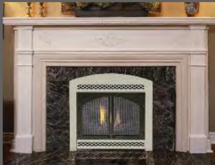
500DVB with Brushed Pewter arched front, black door frame and black fire screen doors