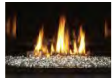
Glass burner kit