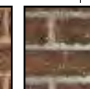
Cottage Red firebrick