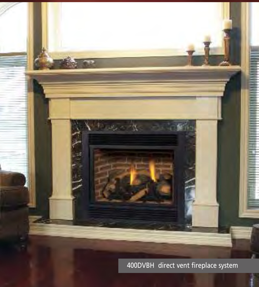
400DVBH direct vent fireplace system