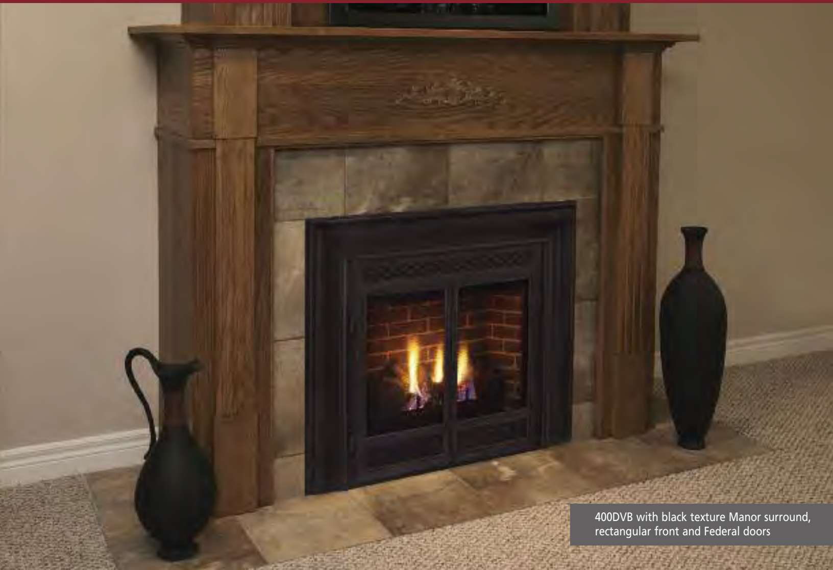
400DVB with black texture Manor surround, rectangular front and Federal doors