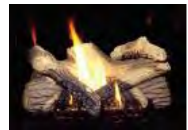
Logs shown with black porcelain liner