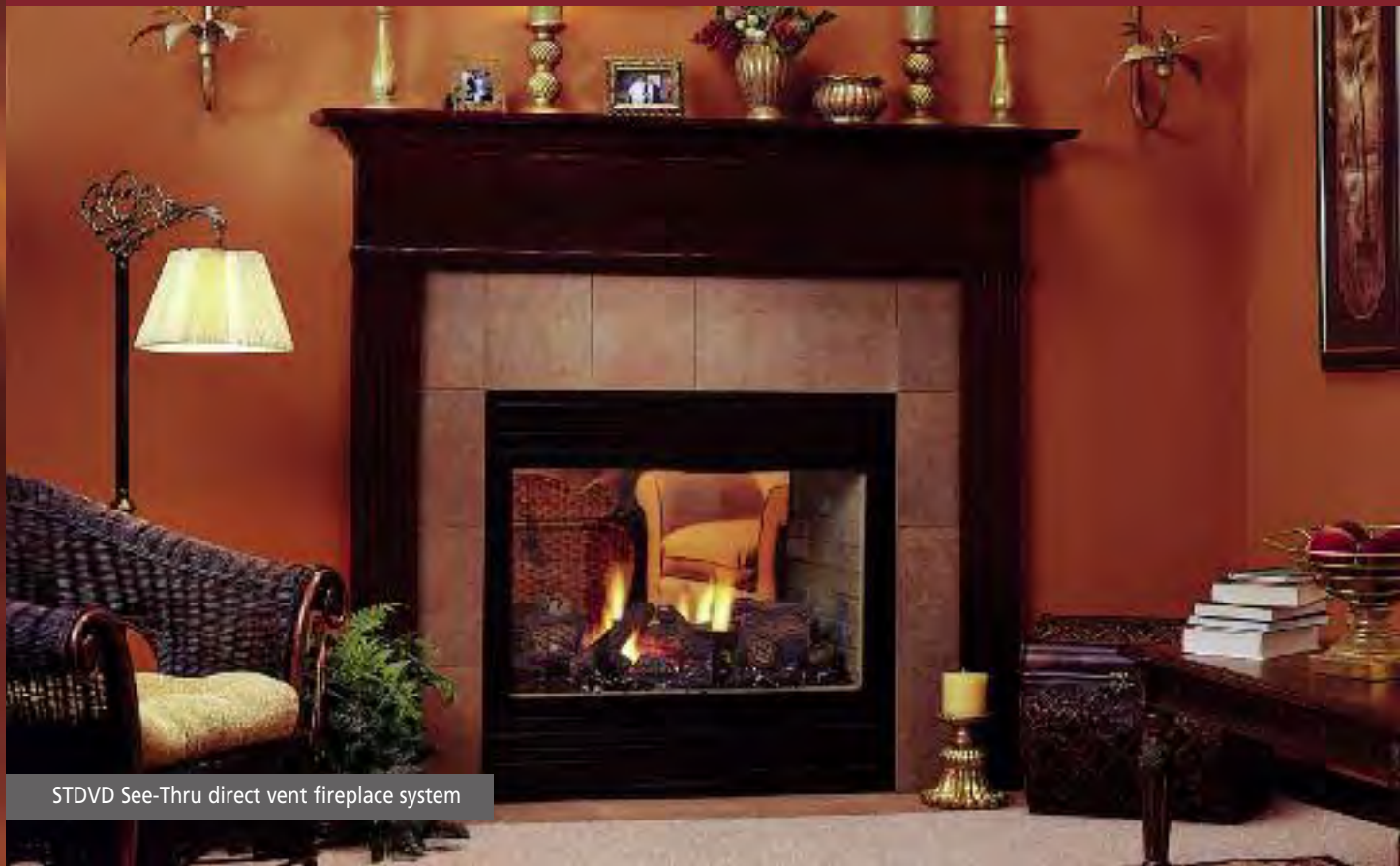
STDVD See-Thru direct vent fireplace system