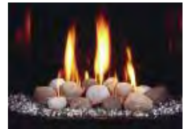
Stone and glass burner kit