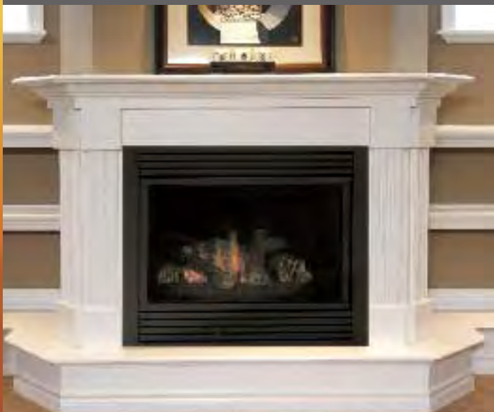
CDVR42 direct vent fireplace system

Give people a place to gather – make fire the focal point of your room again with the Direct Vent series of fireplaces from Majestic.