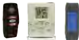
See our Ambient Technologies® catalog for a complete line of remotes and thermostats.