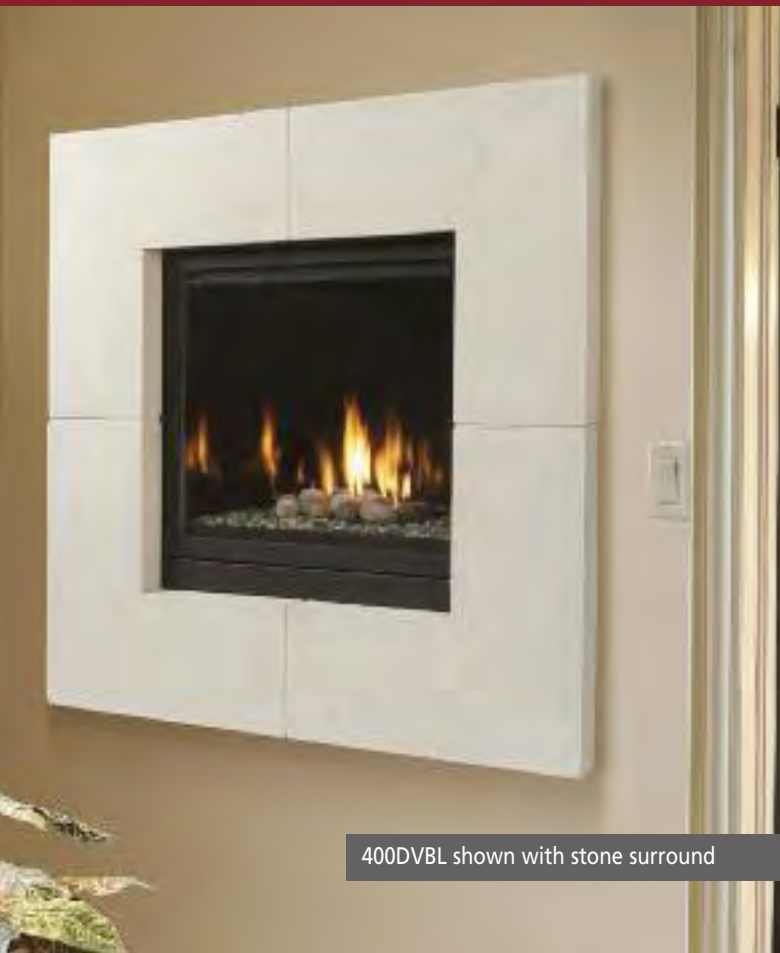
400DVBL shown with stone surround