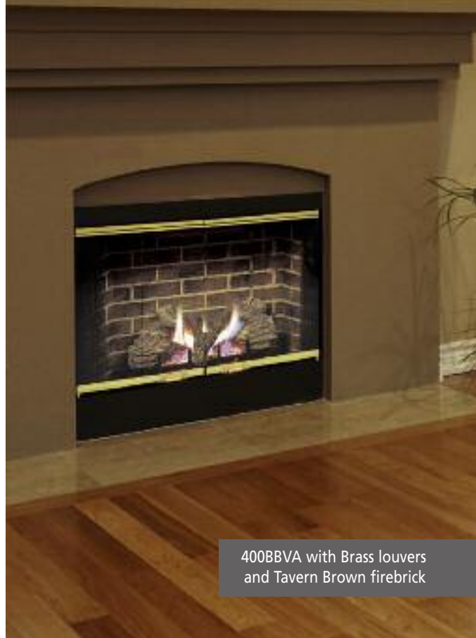
400BBVA with Brass louvers and Tavern Brown firebrick

With 36 and 42 inch sizes, the SBV Series of B vent fireplace systems from Majestic also offer an expansive view. Both sizes come with standard refractory brick and a Black firescreen. With an impressive BTU range from 29,000 to 31,000, the SBV Series are ideal choices for hard to heat rooms.