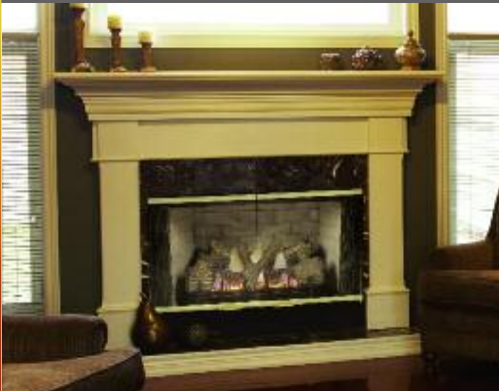
500SBVA with optional bi-fold glass doors and Polished Brass finish

Give people a place to gather – make fire the focal point of your room again with our B vent fireplace systems from Majestic.