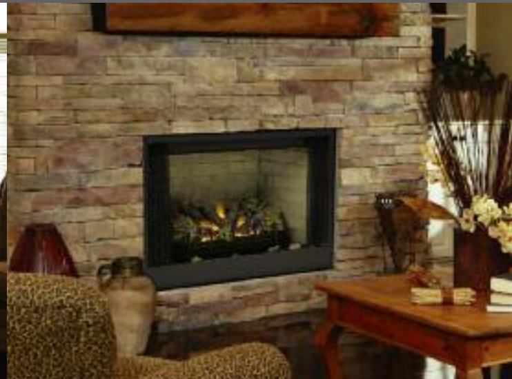
400SBVA with optional bi-fold glass doors and Black finish