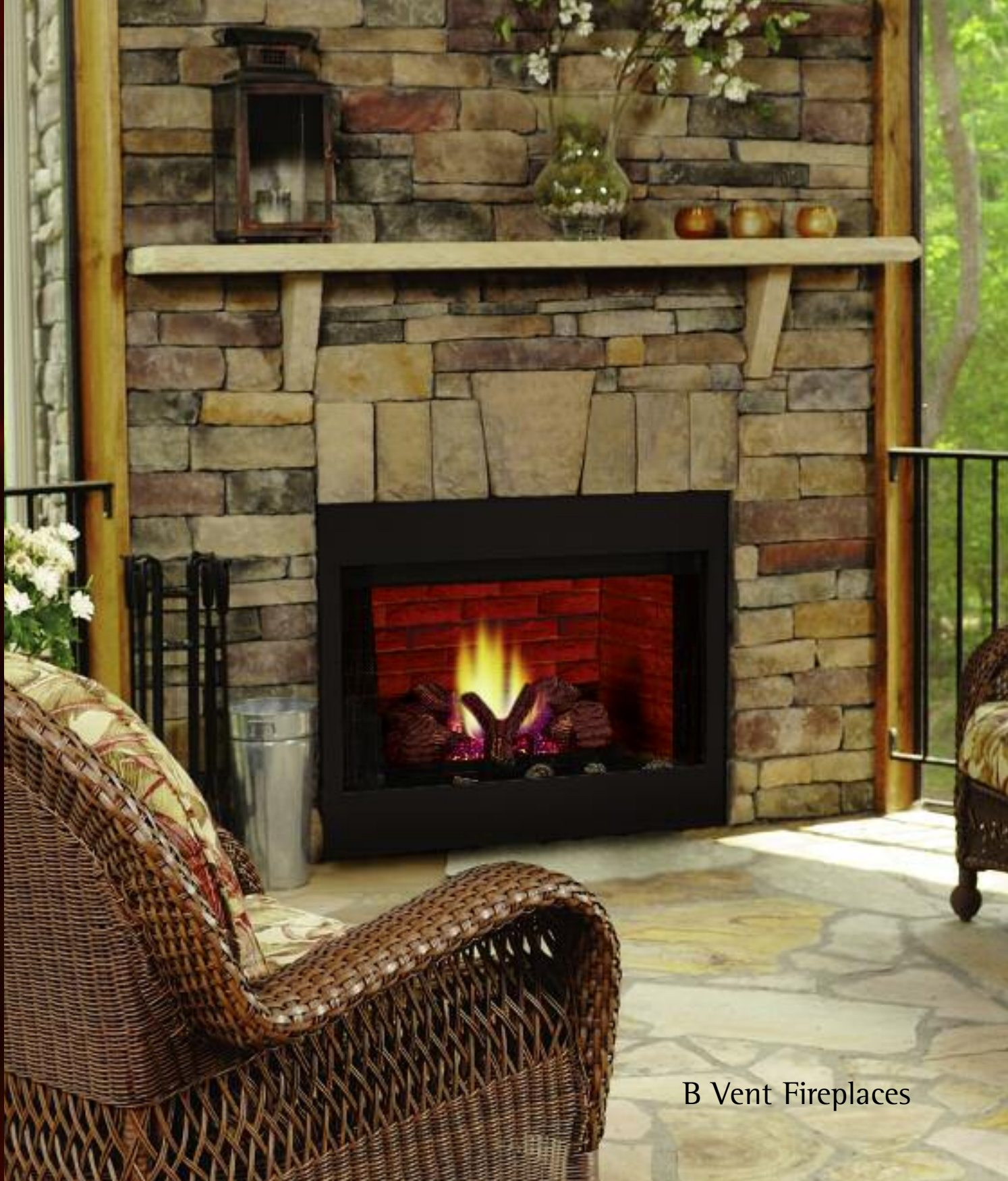
B Vent Fireplaces