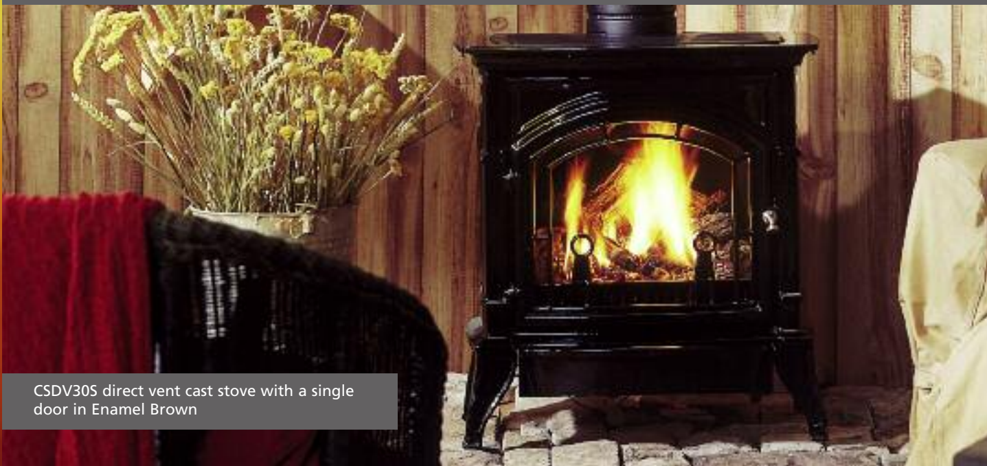
CSDV30S direct vent cast stove with a single door in Enamel Brown

Give people a place to gather – make fire the focal point of your room again with our Direct Vent Cast Stoves from Majestic.