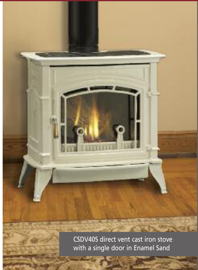
CSDV40S direct vent cast iron stove with a single door in Enamel Sand

The elegant castings of the Concorde direct vent stove are timeless in their design and complement any décor or setting. The intricate design and detailing will add character to any room. Designed with the latest direct-vent technology, this stove proves to be a clean burning, efficient heater and is easily installed into almost any room. Traditional styling combined with the warmth and ambiance of a fire make the Concorde Series direct vent gas stove a valued addition to your home. Our designers have meticulously scrutinized every detail to ensure that you receive the finest gas stove built today.