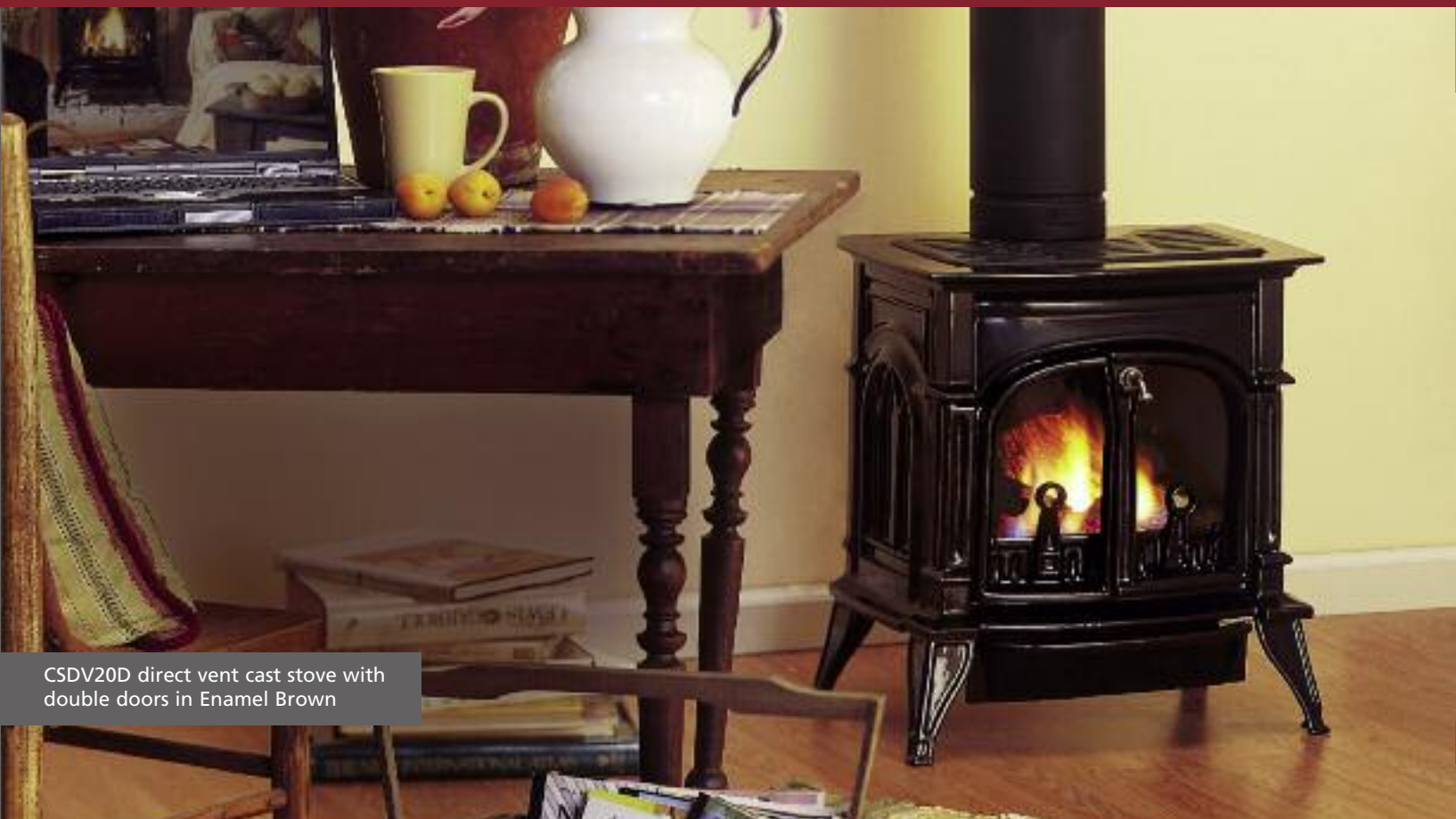
CSDV20D direct vent cast stove with double doors in Enamel Brown