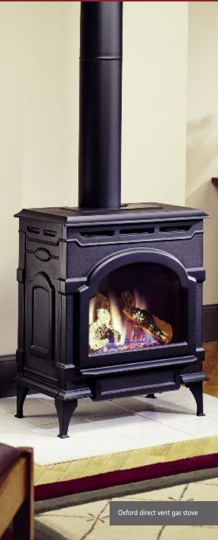
Oxford direct vent gas stove