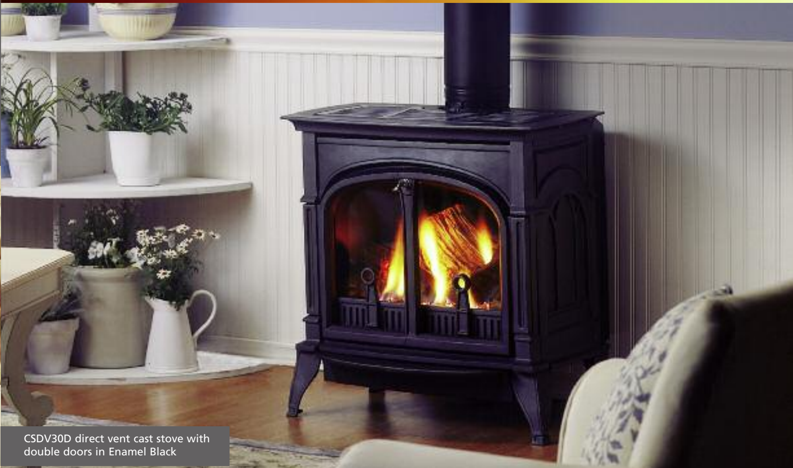
CSDV30D direct vent cast stove with double doors in Enamel Black