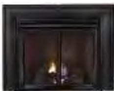
Manor faces available for VF/VFR fireboxes