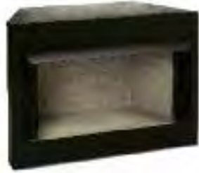
BU500 vent free firebox