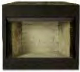
BU400 vent free firebox