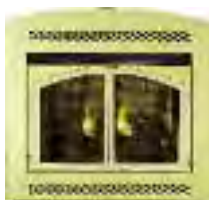
Classic faces available for VF/VFR/MCUF fireboxes