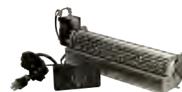
FA2 blower option for BUF fireboxes