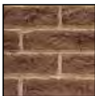
Tavern Brown firebrick