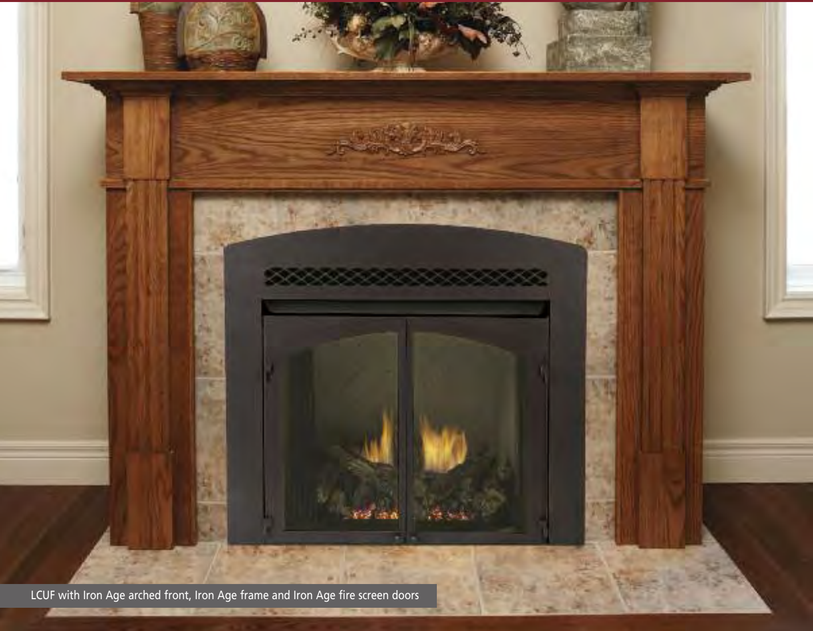
LCUF with Iron Age arched front, Iron Age frame and Iron Age fire screen doors