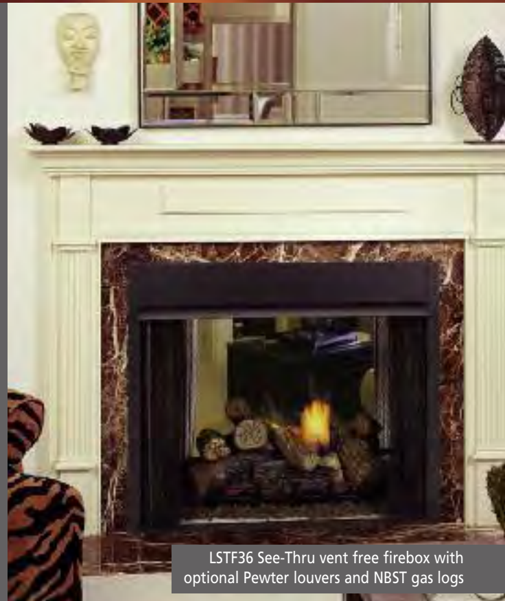
LSTF36 See-Thru vent free firebox with optional Pewter louvers and NBST gas logs