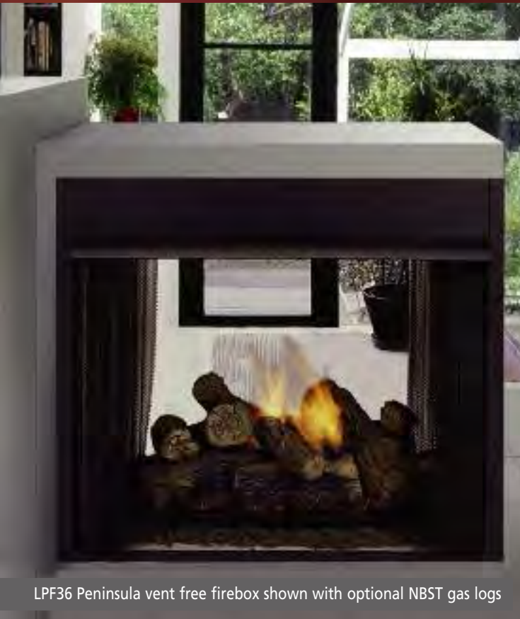
LPF36 Peninsula vent free firebox shown with optional NBST gas logs

Our Majestic vent free fireboxes also come in exciting designer styles that offer dynamic design applications. Available in See-Thru, Peninsula and Corner models, these sophisticated fireboxes add style and warmth to your rooms while maintaining a contemporary feel.