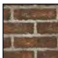
Cottage Red firebrick