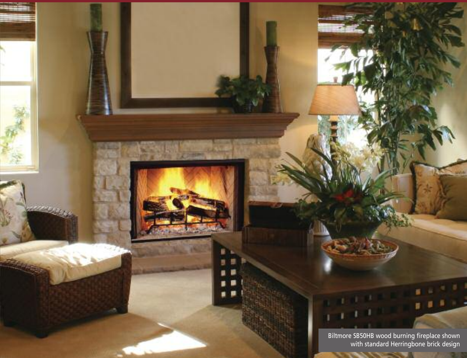
Biltmore SB50HB wood burning fireplace shown with standard Herringbone brick design