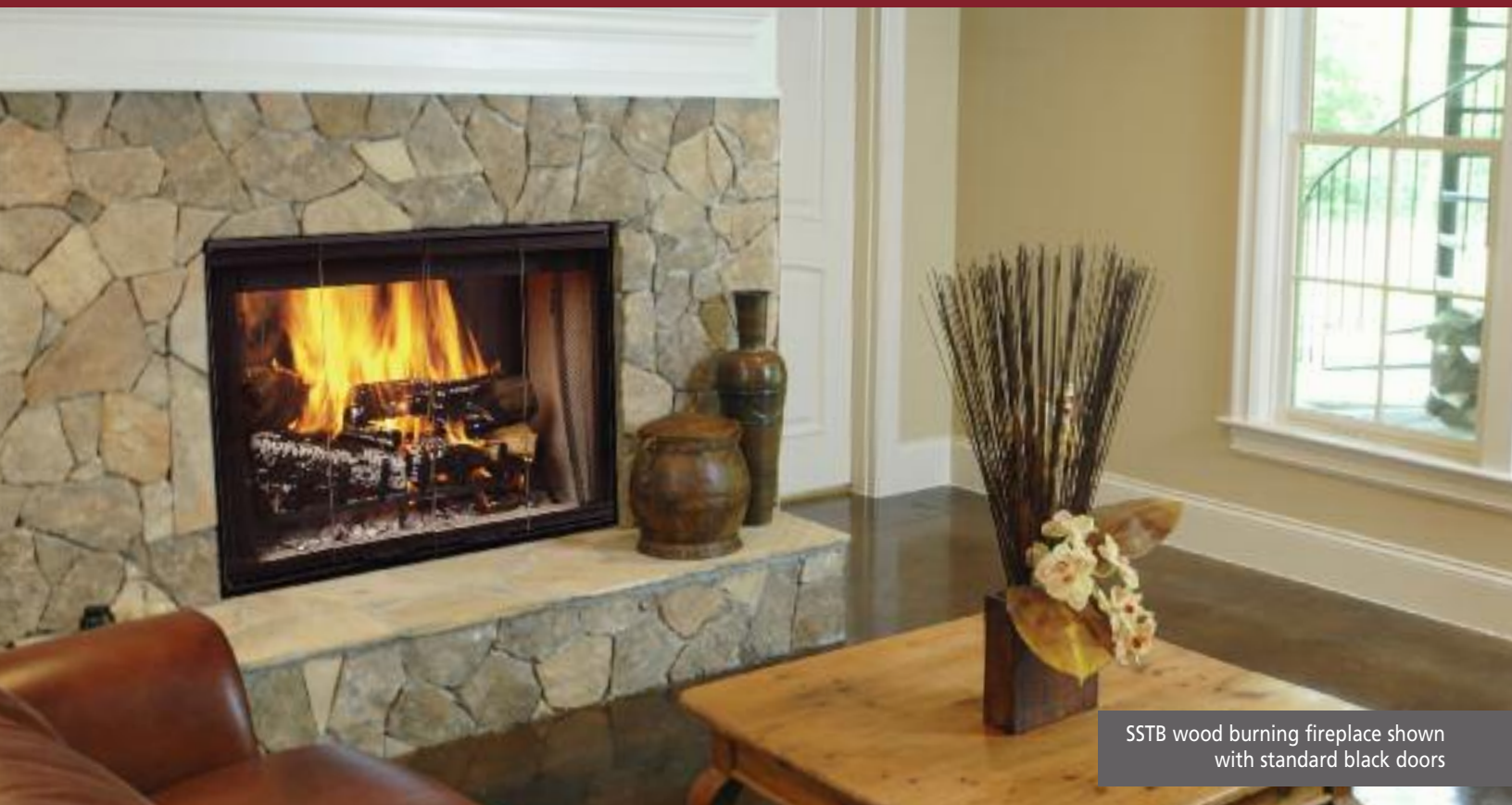
SSTB wood burning fireplace shown with standard black doors