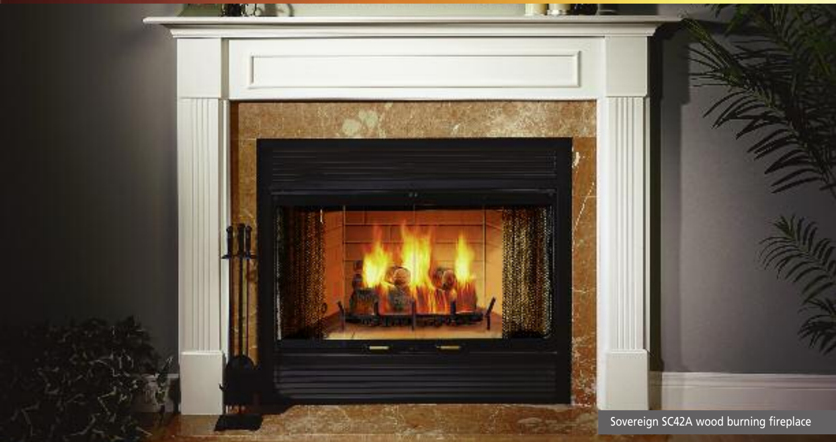
Sovereign SC42A wood burning fireplace