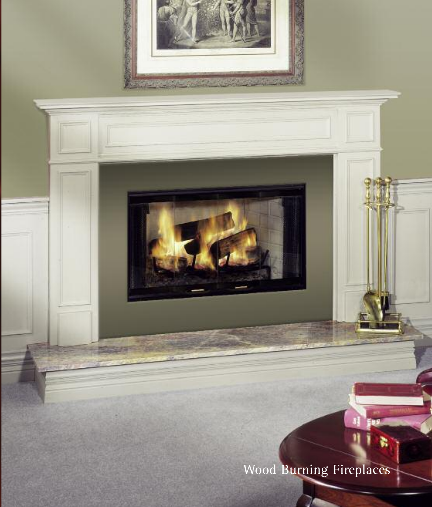
Wood Burning Fireplaces