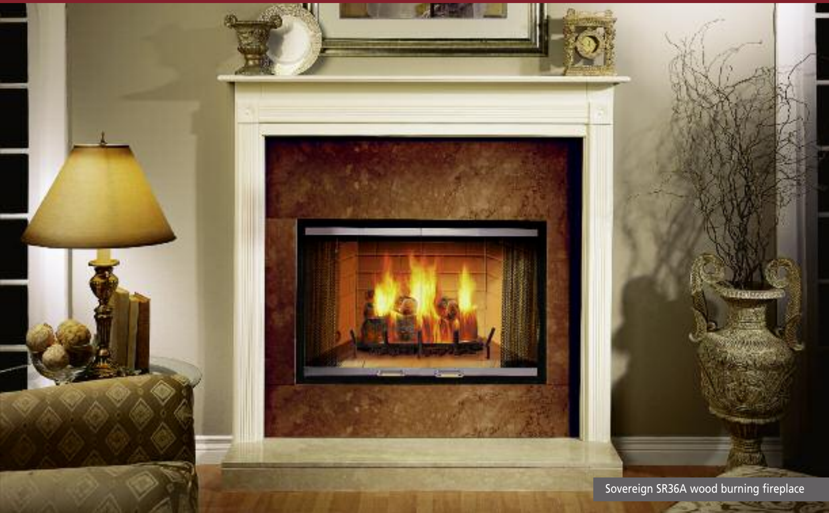
Sovereign SR36A wood burning fireplace