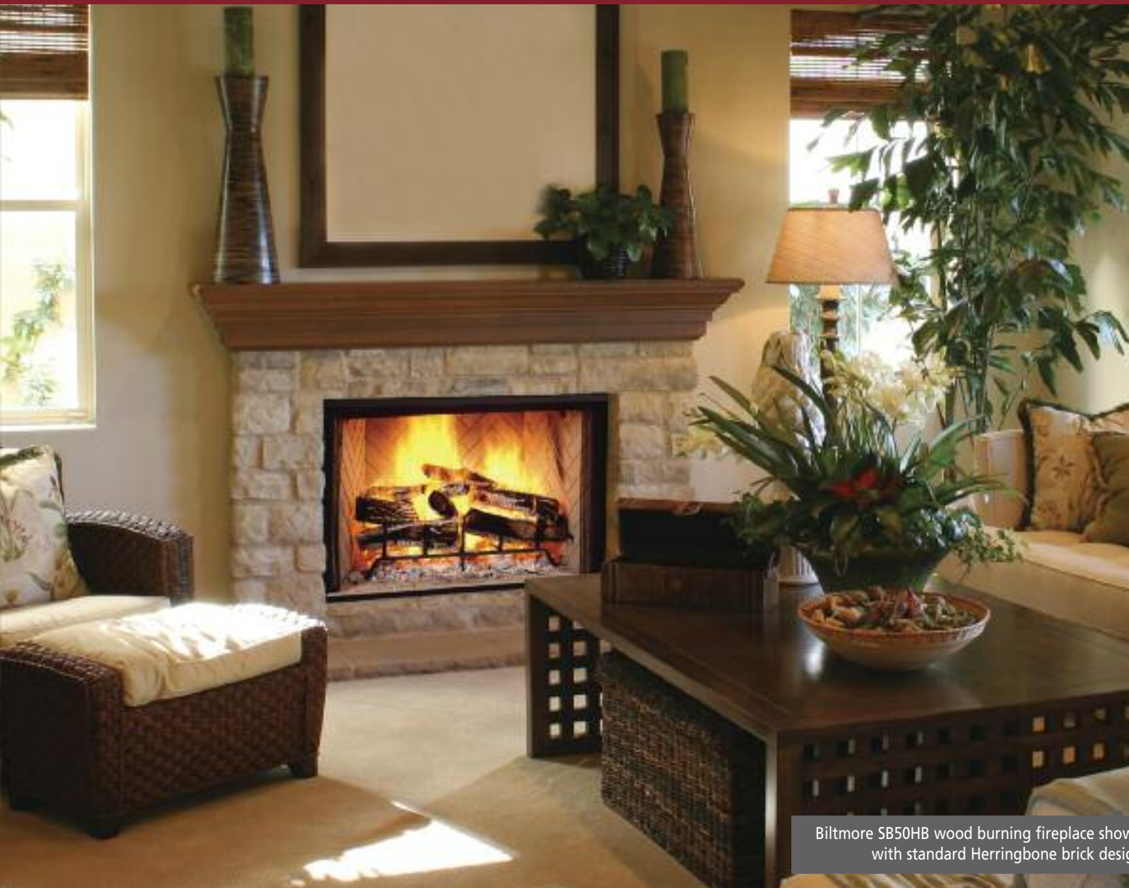
Biltmore SB50HB wood burning fireplace shown with standard Herringbone brick design.