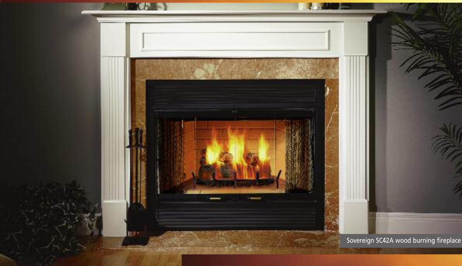
Sovereign SC42A wood burning fireplace