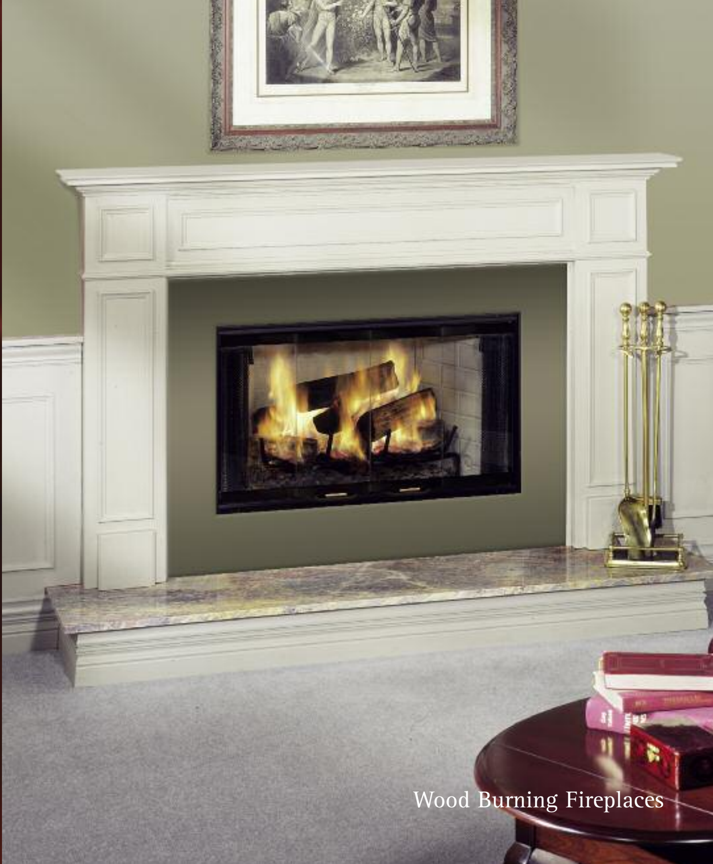
Wood Burning Fireplaces