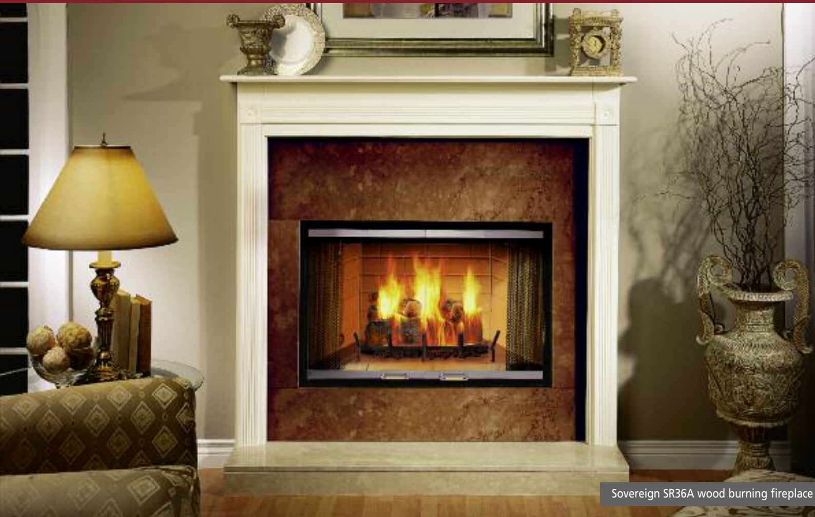
Sovereign SR36A wood burning fireplace