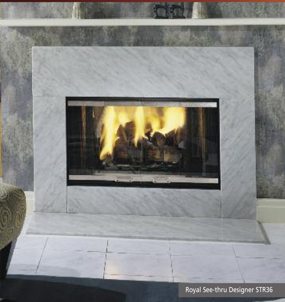
Royal See-thru Designer STR36