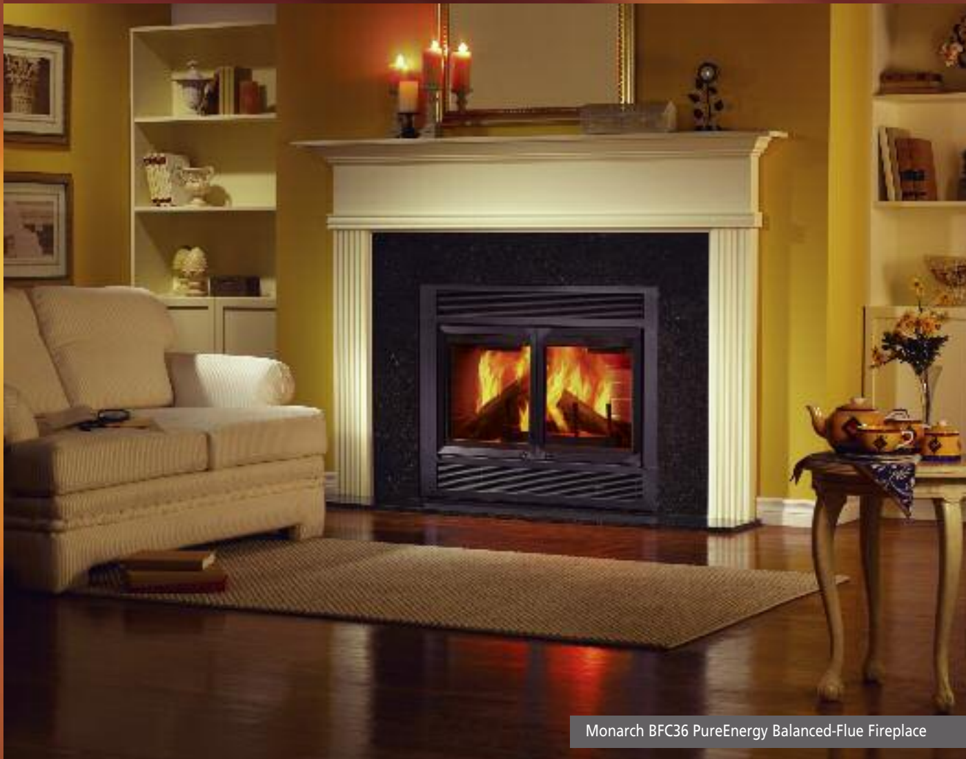
Monarch BFC36 PureEnergy Balanced-Flue Fireplace