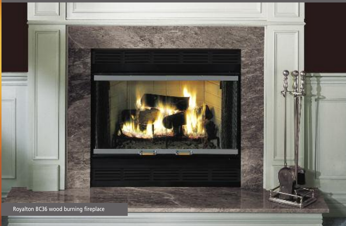
Royalton BC36 wood burning fireplace

Give people a place to gather – make fire the focal point of your room again with a wood burning fireplace from Majestic.