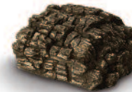
Ember remote receiver cover