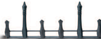
Decorative grate + Andirons

See our Ambient Technologies® catalog for a complete line of remotes.