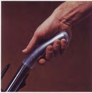
Fatigue-fighting vinyl hand grip.