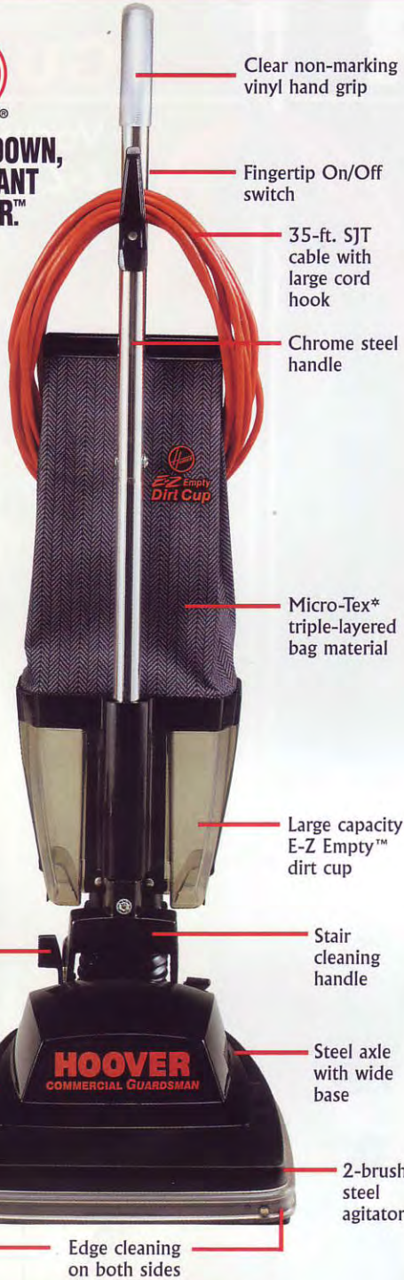
Clear non-marking vinyl hand grip