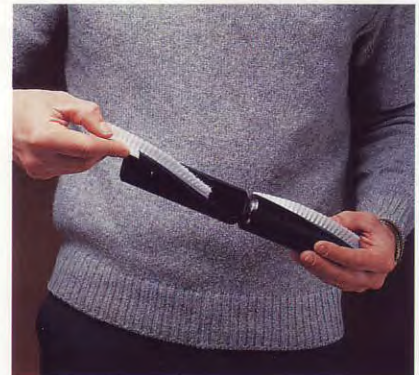
Easily replaceable agitator brushes help make this HOOVER cleaner "user-friendly."