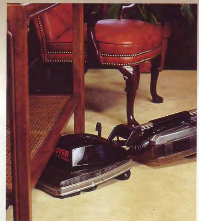
Three-position handle lays flat for low clearance furnishings.