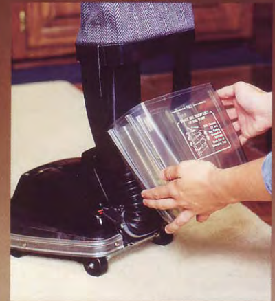
Dirt is collected in the large commercial-duty E-Z Empty™ dirt cup.