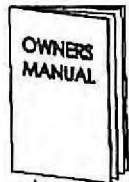
7762 Owner's Manual