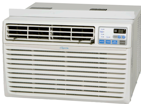
Room Air Conditioner: RAD-101B