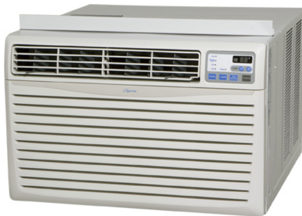
Room Air Conditioner: RAD-121B