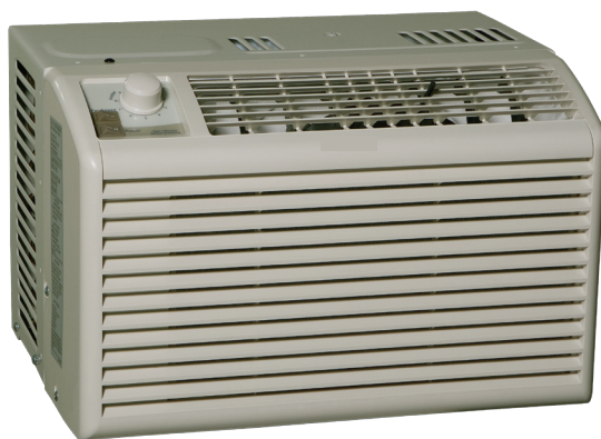
Room Air Conditioner: RG-51B