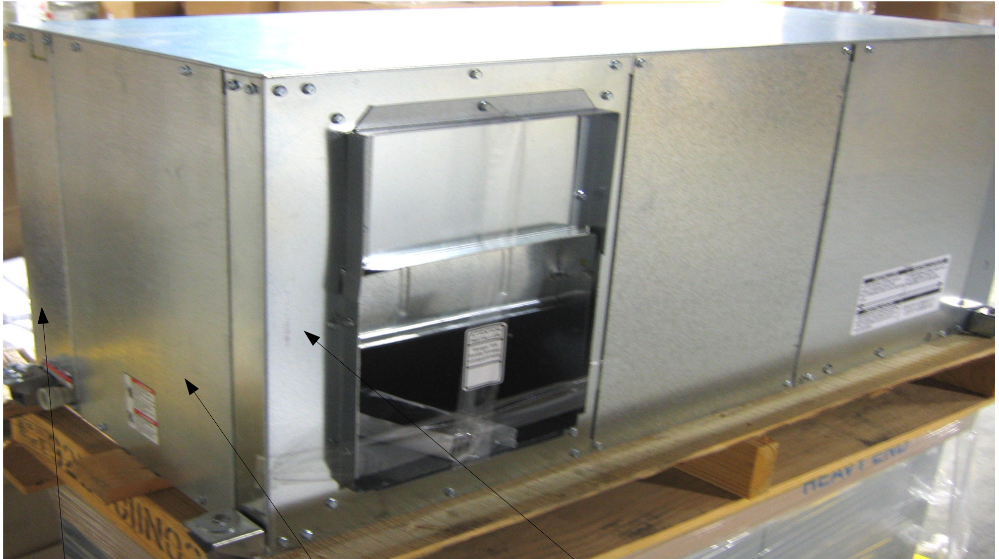
Corner Post, Air Handler