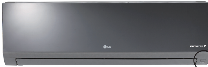
Location of light-emitting diode (LED) displays