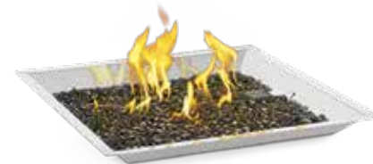
Square Burner Kit - GPFS60