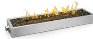
Linear Burner Kit - GPFL48

Consult your owner's manual for complete and up-to-date measurements and installation instructions for proper clearances to combustible materials.