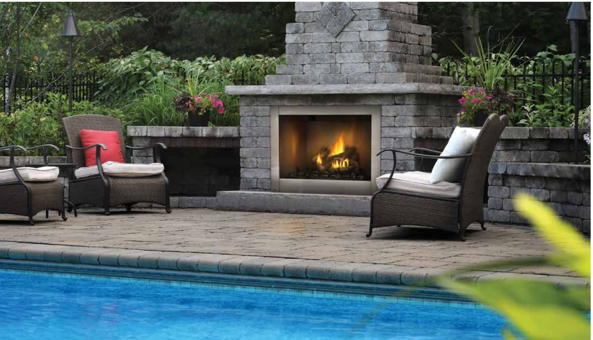
The Riverside™ 42 Clean Face