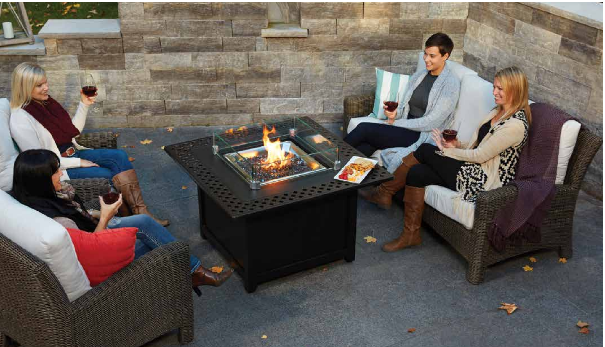
The Kensington Square Patioflame® Table