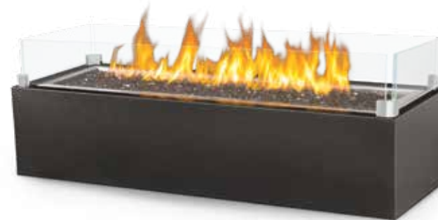
The Linear Patioflame® shown with standard Topaz CRYSTALINE™ ember bed and windscreen