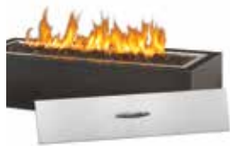
Brushed Stainless Steel Cover* and Hammertone Pewter Cabinet (included)