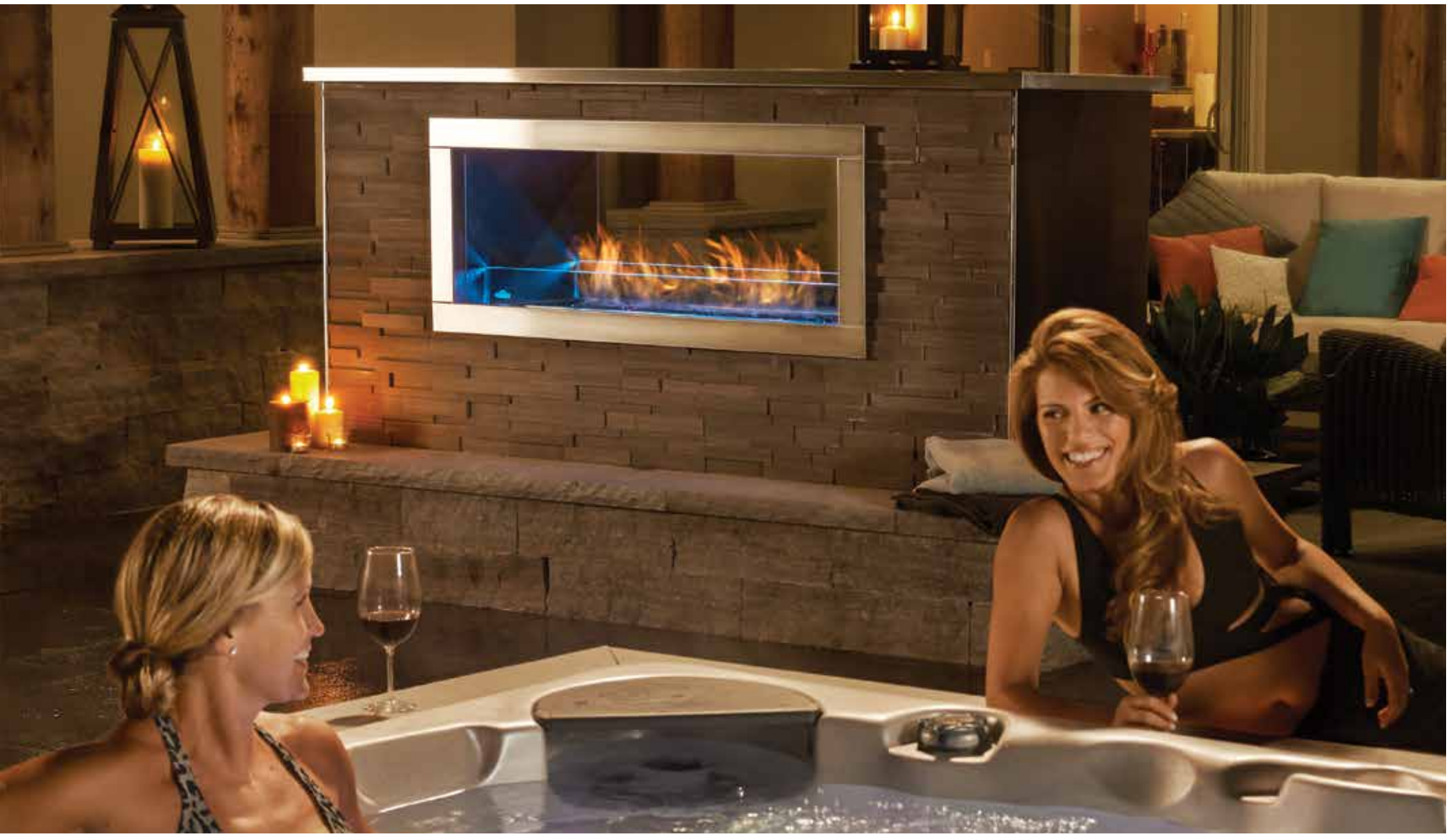
The Galaxy™ See Thru shown with optional four-sided trim kit and accent light set on blue