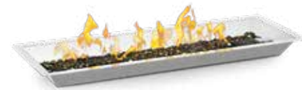
Rectangle Burner Kit - GPFR60