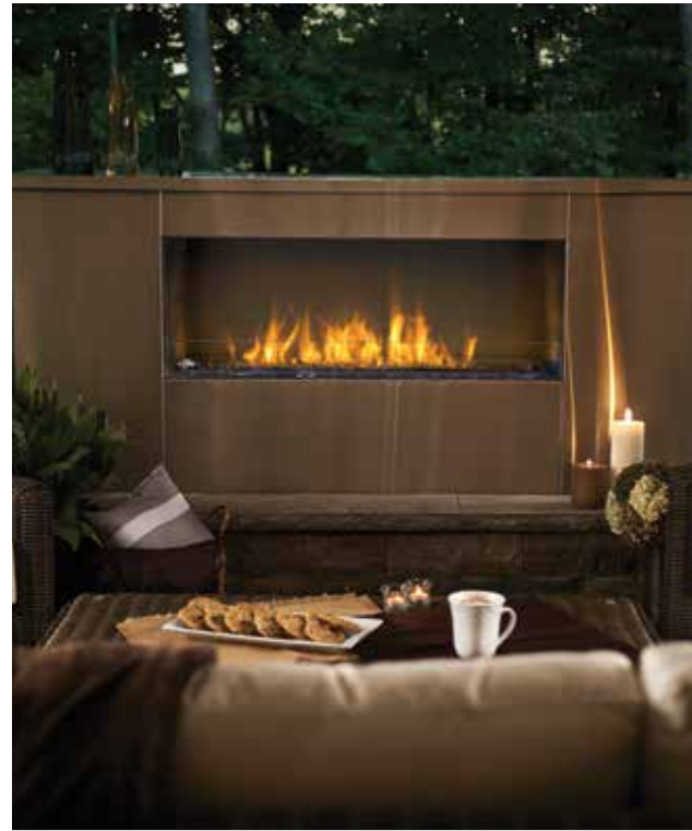
The Galaxy™ shown in a custom built-in stainless steel application